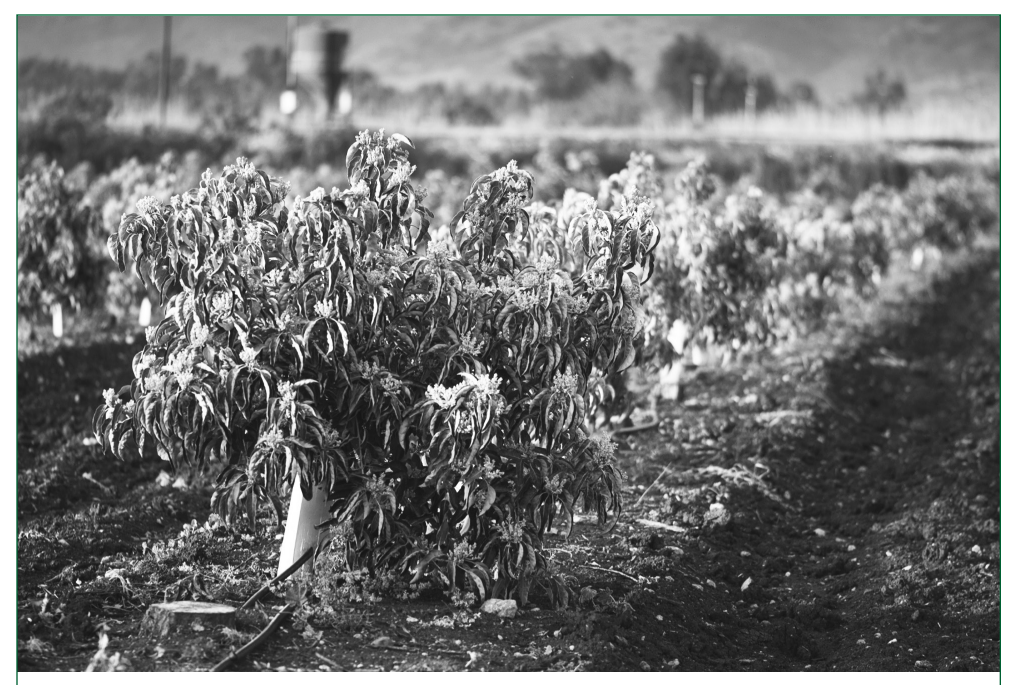
California avocados account for 90% of production in the United States and many growers face challenges with water supply and quality. This study examines several factors that influence the adoption of water-saving technologies by avocado growers in California.

ranged from $1.26/hcf (one hundred cubic feet) to $3.93/ hcf, with the highest prices reported in San Diego and Riverside Counties.