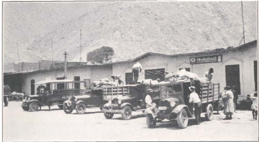
Loading fruit, principally avocados and cherimoyas at Chosica, en route to Luna, Peru.

The avocado is known in Peru by the name "palta." This is evidently a name originated by the Inca Indians, and its use indicates that avocados were cultivated in land occupied by them before the arrival of the Spanish explorers. It is not likely, however, that the avocado is indigenous to any part of what is now Peru. In the Montana, that is in the section east of the Andes, avocado trees may be seen growing wild, but usually only near trails, or in other places where it seems probable that seeds could have originally been dropped by passers-by.