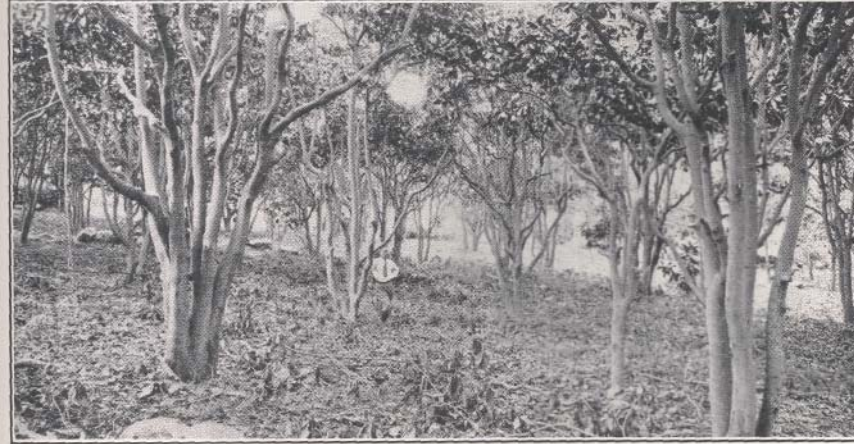
A Santa Eulalia avocado orchard just after pruning.