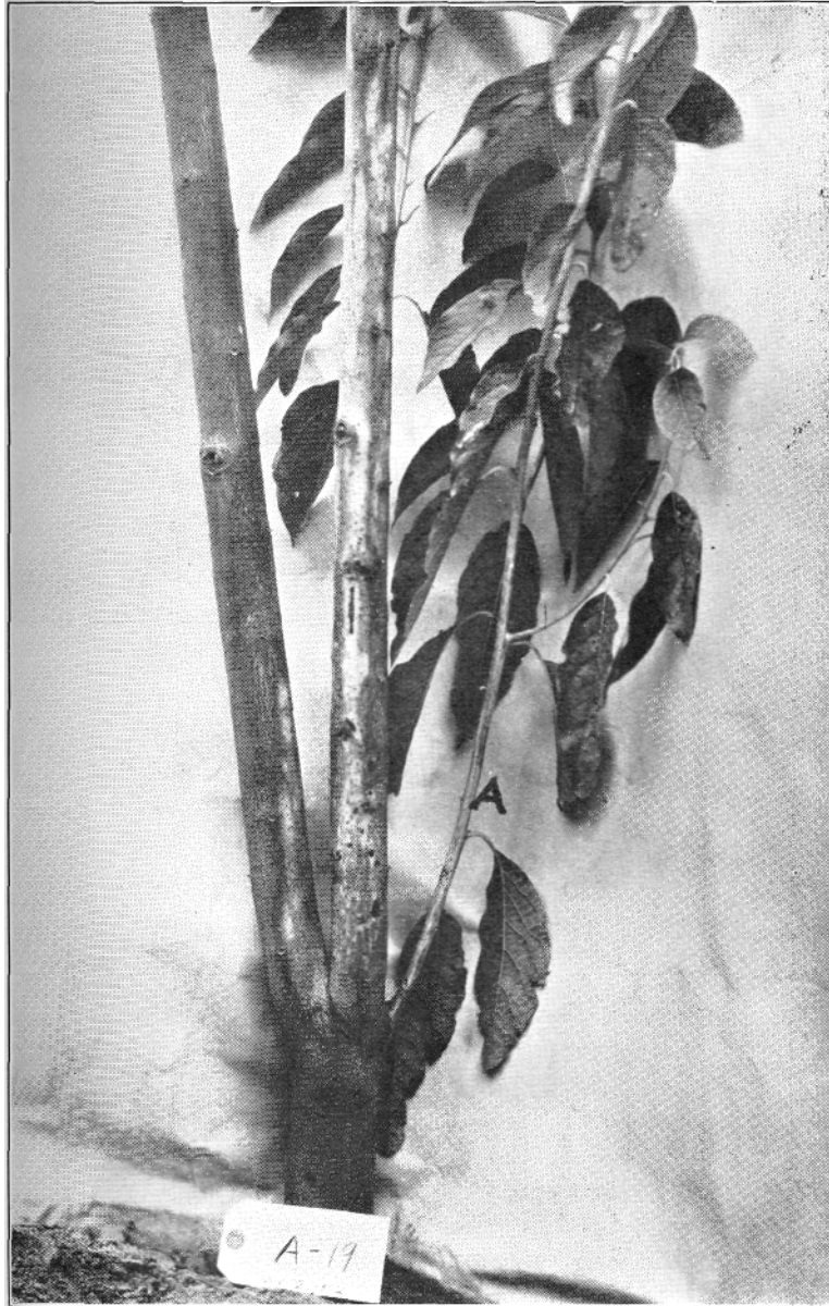
Fig. 3. The transmission of sun-blotch from an infected scion A to the seedling stock. Vertical progress of the symptoms of the disease in the stock, to which it is transmitted, is much more rapid than horizontal movement. The symptoms in the stock (large yellow blotches, with occasional necrotic areas) have developed in bark which at first appeared healthy.

To get more definite evidence, however, we are growing 41 seedlings, the parents of which were badly sun-blotched trees of the Caliente variety. These are growing parallel to 52 seedlings of normal trees of the same variety. The seeds were collected in 1929 by Dr. L. D. Batchelor, Director of the Citrus Experiment Station, from diseased trees at that place, and from normal trees at the San Joaquin Fruit Company, Tustin. At the present time there is apparently no great difference in the behavior of the trees from the two sets. In only one tree derived from the sun-blotched source are there subtle characteristics which may mean the tree is affected. It is planned that these trees will