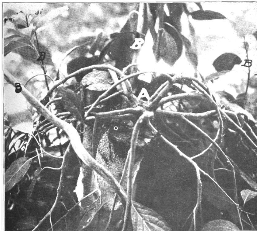
Fig. 1. Sun-blotched scion (A) of the Fuerte variety set into a previously healthy tree. The scion has developed marked symptoms of the disease. New shoots (B) arising from the stock also show the disease to a very pronounced degree.

When scions were used which were taken from badly affected Fuerte wood, the growth resulting from these buds was invariably sun-blotched, in many cases being very much intensified. (See figure 1.) This growth was so severely affected that necrotic areas with exudation of a white substance appeared on it, and it finally died after obtaining a length of 2 to 5 feet. The symptoms at this stage frequently resembled those of sunburn, in spite of the fact that such burning was prevented by shading.