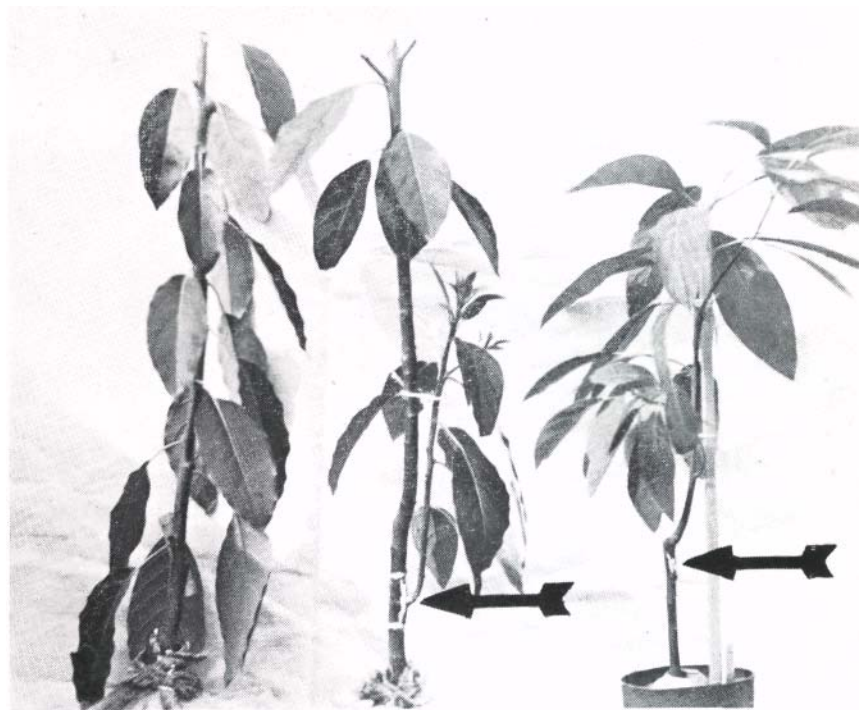
Fig. 1. Types of trees planted: Left to right—standard, tied-up bud, tip graft. Arrows point to bud unions.

The planting consisted of 137 MacArthur trees on Guatemalan, Mexican, and West Indian rootstocks. It included the three types of trees shown in figure 1: standard trees with trunk diameters near the bud union of from 1/4 to 3/4 inch; "tied-up buds" (immature budlings); and "tip grafts" which were propagated by splice grafting a one-bud scion onto a potted seedling.