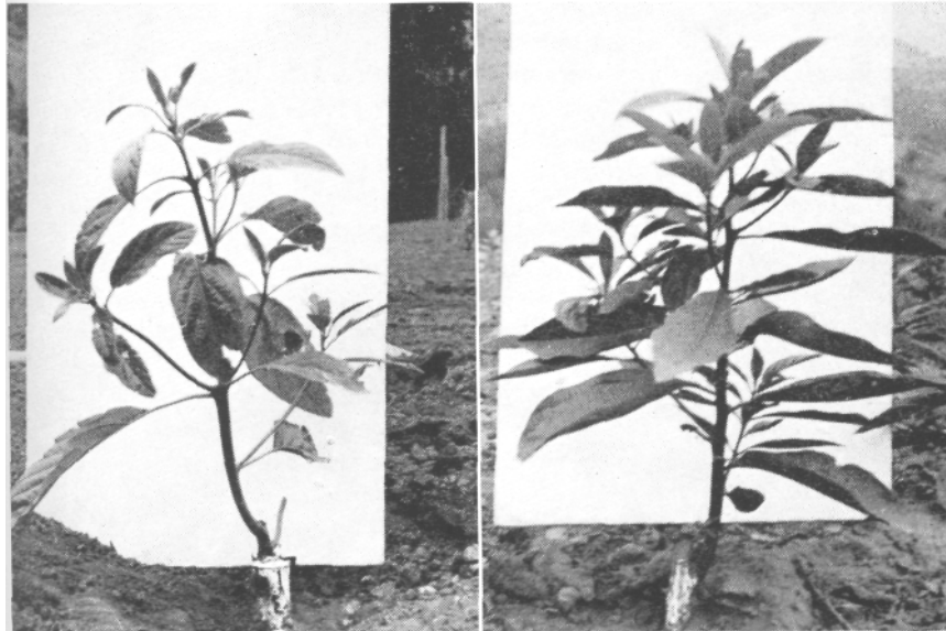
Fig. 3. About 3 months after the freeze the grafted tree (left) was well established before the rootstock sprout (right) reached budding size.

The results were better than was expected. Of the 75 standard and tied-up buds that were grafted (tip grafts were not used), 63 percent developed good tops before the ungrafted stumps, or those on which the graft failed, produced sprouts suitable for budding (Fig. 3). This indicates that grafting hastened the resumption of the plant's normal functions.