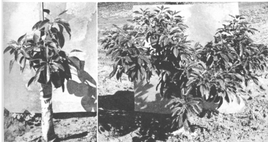
Fig. 4. Difference in size between a grafted tree (left) and a protected tree which rebuilt itself. Photo taken from same distance 8 months after the freeze.

Most of the failures were undoubtedly due to slight cold injury to the trunk cambium which could not be detected at time of grafting. In fact, four of the trees on which the graft failed produced no root sprouts, indicating that the entire root system died as a result of the freeze. In other cases where the graft failed, sprouts appeared only below