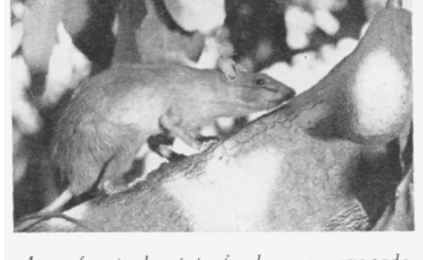
A roof rat about to feed on an avocado.

Most of you have seen avocados partially devoured on the tree or on the ground, and in most cases this damage is caused by rats. I won't take your time now for a discussion of control methods except to point out that a good bulletin has been prepared by the University on the control of rats and mice. The rat that commonly occurs in avocado orchards is the roof rat, which is sometimes called the gray rat or Alexandrine rat. It is a small gray species and quite prevalent everywhere where avocados are grown. There is also a black species that is about the same size, but occurs only around port towns where they are carried in on ships, and they don't get very far inland. Then there is the famous Norway rat, a large species, which sometimes occurs in avocado trees. Opossums get in the trees and eat some fruit. The pack rat will eat avocados, but its damage is more apt to be a chewing on the bark of green twigs.