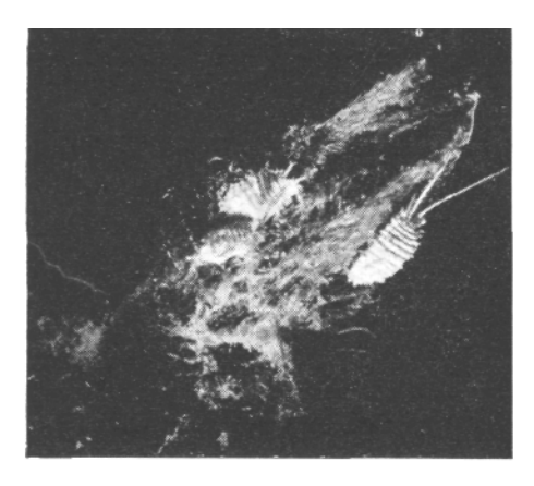
Long-tailed mealybugs attacking newlyformed foliage on the scion of a grafted avocado tree.

the natural enemies have a chance to build up and destroy the mealybugs. In that case also, you can depend on DDT for protection. You can spray with 2 pounds to 100 gallons, using perhaps a knapsack sprayer, or you can dust with a 10 percent dust. We think the best thing to do is to make a thick slurry of the DDT and water in a bucket and take a paint brush and paint this slurry on the top of the trunk and six inches or more down the side. If you apply it in this manner and then the grafter comes back later and reseals the graft, as they often do, then you have to put some more insecticide over the sealing substance. Otherwise it forms a bridge by which the mealybugs may reach the place where they can do their damage.