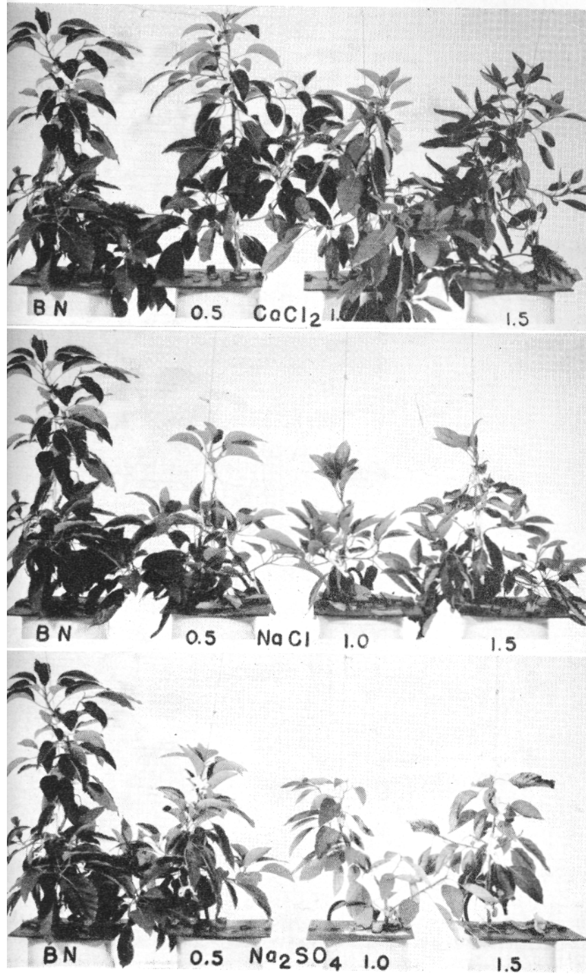
Fig. 1. Avocado plants eight weeks after the initiation of differential salt treatments. Plants were grown in a series of culture solutions to which \text{NaCl} , \text{CaCl}_2 or \text{Na}_2\text{SO}_4 had been added to increase the osmotic pressure of the base nutrient solution by 0.5, 1.0, and 1.5 atm.