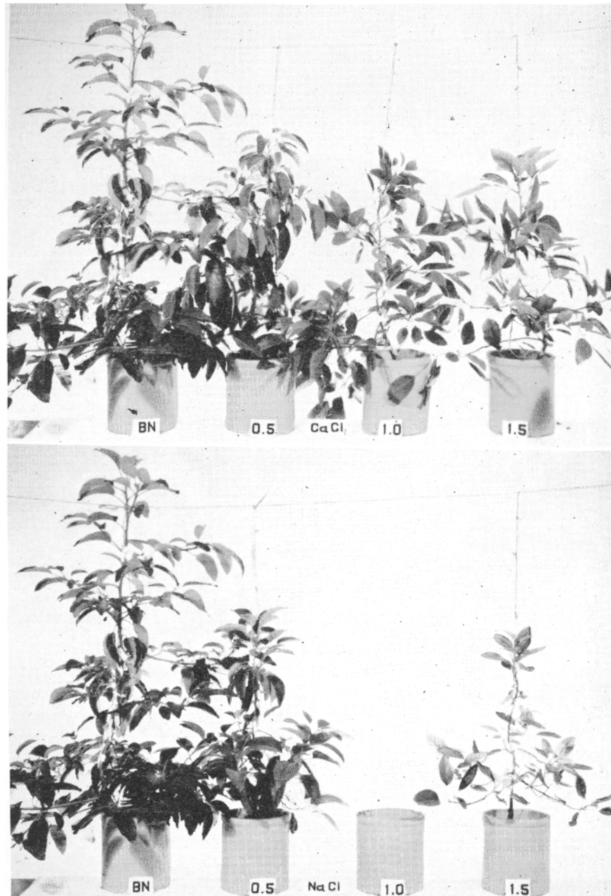
Fig. 2. Avocado plants twenty-three weeks after the initiation of differential salt treatments. All plants in the \text{Na}_2\text{SO}_4 series had been harvested prior to this time as they were already dead or in a dying condition.