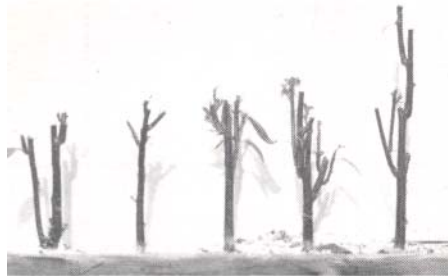
Fig. 2. Parent seedlings after two or three lots of cuttings had been taken.

The first cuttings were taken when the seedlings were about 6 inches high. Only one cutting, about 3 inches long, was obtainable because there were then no laterals. The removal of the growing point resulted in the production of laterals which furnished the second lot of cuttings. This procedure was continued until it appeared that the mother plant was no longer able to regenerate new suitable material (Fig. 2). It should be mentioned here that some of the parent plants died as a result of this operation but that most of those that survived eventually developed into sturdy plants.