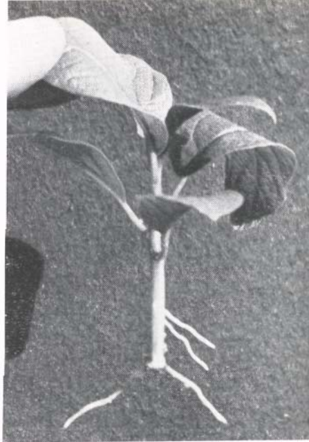
Fig. 3. Rooted cutting.

Two to 5 lots of cuttings were obtained from each seedling, and, as table 1 shows, the total number of rooted cuttings from seedlings of each variety varied. Also shown is the relative weight of seed for each variety to indicate that seed size was not related to the number of cuttings yielded during the five-month period. For example, Nabal and Mexicola yielded the same number of cuttings, although the seed of the former weighed about 47 grams and the latter only 18 grams.