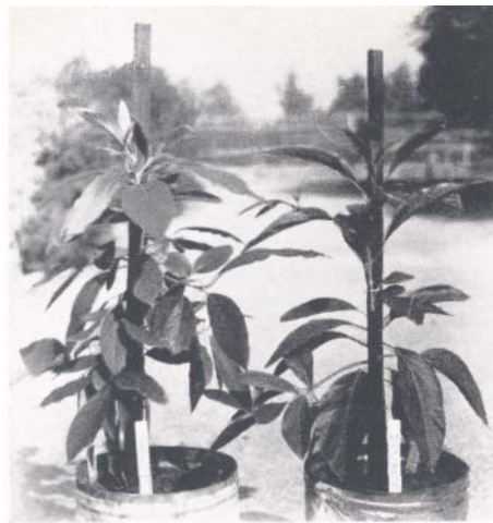
Fig. 5. Cuttings about 8 months old rooted by the method described by Frolich. Left—Anaheim; Right—Dickinson.

Another observation of interest is that the response to rooting was most pronounced for the first two lots. The third and fourth lots did not root as rapidly as the first and second.