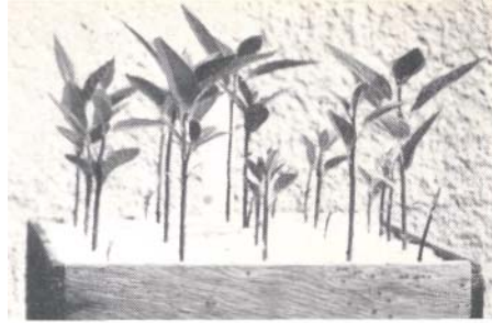
Fig. 1. Seedlings were in this growth stage when first lot of cuttings were taken.