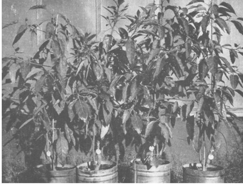
Four Casper No. 2 root clones side grafted with Fuerte scions from the same tree. Seedling stocks cut back, but not yet removed.

The first large-scale development of any rootstock standards appears to have started in Europe, and to be primarily identified with the Mailing Research Station, England. This work resulted in the tabulation and vegetative reproduction of apple stocks having definite characteristics, and predictable growth and fruiting behaviour when combined with selected fruiting varieties. "Mailing" serial numbers were employed for identification of the various rootstocks.