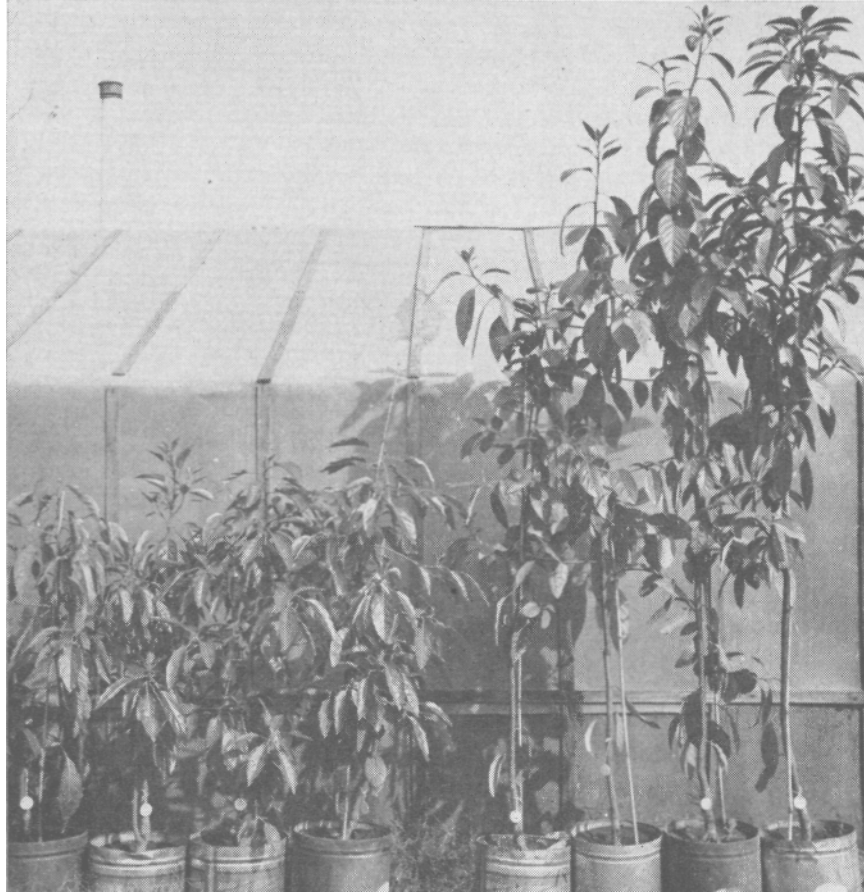
Eight Casper No. 2 root clones. Four at left have been side grafted with scions from the same tree. Four at right still have the sexual-variant tops intact.

In an eight year old Valencia orchard in the Corona district, where individual tree records were carried on for several years, many of the trees were found to have limb variations carrying corrugated fruits. A study of the orchard revealed that 12% of the total trees were entire-tree variants which had undoubtedly been propagated from similar limb variations.