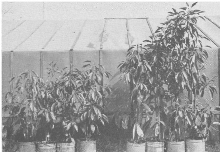
Eight Casper A o. 2 root clones. Four at left have been side grafted with scions from the same tree. Four at right have had the seedling tops grafted with scions from the same tree. Size of "sandwiched" trees directly reflects growth of the prior seedling tops.

Convictions (fortunately) usually require more than mere circumstantial evidence. To prove that the genetic-variant seedling rootstocks were responsible, "as charged", required asexual reproduction of the root tissue that supports these particular Fuerte trees. This re-grown root tissue then would have to be recombined with scion wood from these very trees, and a reasonably large number of the resultant trees would have to be grown to fruiting maturity. Only in this way could the question of productive responsibility be resolved.