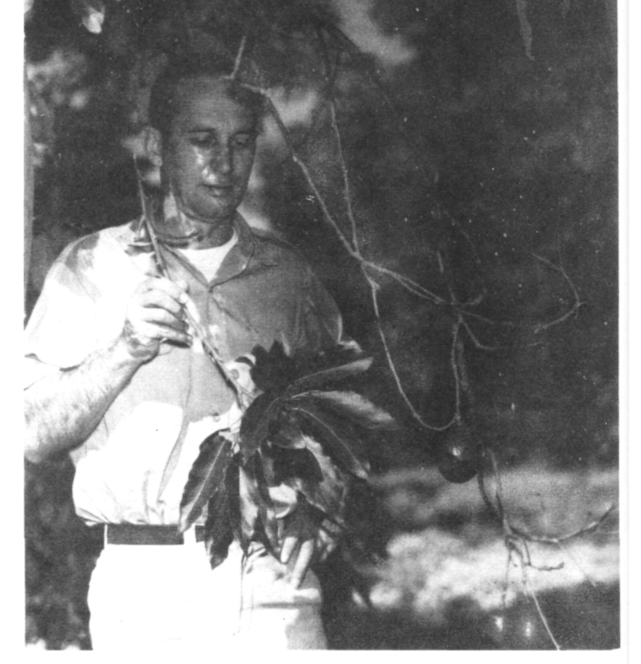
Fig. 6. Avocado limb which had developed healthy terminal growth and numerous leaf buds after complete defoliation by hand-picking, compared to limb which died after defoliation caused by six-spotted mite damage.