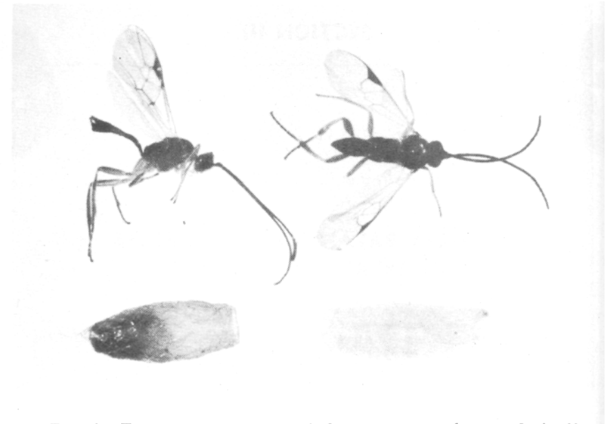
Fig. 1. Two wasp parasites of the omnivorous looper. Left: Meteorus sp. and its cocoon. Right: Apanteles sp. and its cocoon.

On July 17, 1954, a limb having about 200 leaves was selected as the main experimental limb (Fig. 2). This limb was at a height of about 6 feet on the west side of a tree of the Anaheim variety. Two smaller experimental limbs were selected, one on the south side and one on the north side of the tree. These limbs were all trimmed so that there was no leaf contact with neighboring limbs.