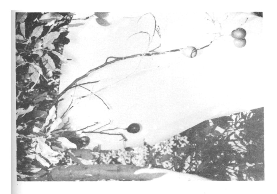
Fig. 5. Defoliated and dead limbs on north side of DDT-treated tree. This damage was caused by the feeding of large numbers of sixspotted mites which developed on this tree after the natural enemies of the mites were killed by the use of DDT.

Figure 5 shows some of the defoliated and dead limbs on the north side of the "DDT tree". The leaves seen above the dead limbs were un-sprayed and thus were kept free