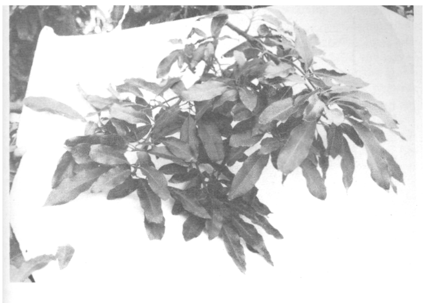
Fig. 2. Experimental limb of about 200 leaves on west side of avocado tree.

When this study was started, on July 17, there was no visible injury by the avocado brown mite on the main experimental limb. At this time the population was about one mite for every four leaves. For the first month these mites reproduced slowly. By August 17 previously selected sample leaves averaged 7.6 mites per leaf. At this time the brown mites were actually more abundant on the neighboring check tree (Fig. 3). Figure 3 shows the relative brown mite populations on a 10-leaf sample from the experimental limb and on a 10-leaf sample from the check tree. The brown mite population on the check tree continued to increase until September 9, at which time it peaked at 395 mites per 10 leaves; by September 25, it had decreased to practically zero. The brown mite population on the experimental limb continued to increase until September 18, when it peaked at 1098 mites per 10-leaf sample. After this time the brown mite population on the mature leaves of the experimental limb began to drop rapidly. It may also be seen in figure 3 that during this same interval the brown mite population began to increase on the new growth developing on the predator-free terminals. The brown mite population density continued to increase rapidly on this new growth until the experiment was discontinued on October 10.