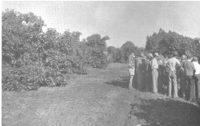
Figure 4.—Avocado orchard at Redlands Experiment Station, with some of the visitors watching a topworking demonstration.

Now for a few remarks on general observations.