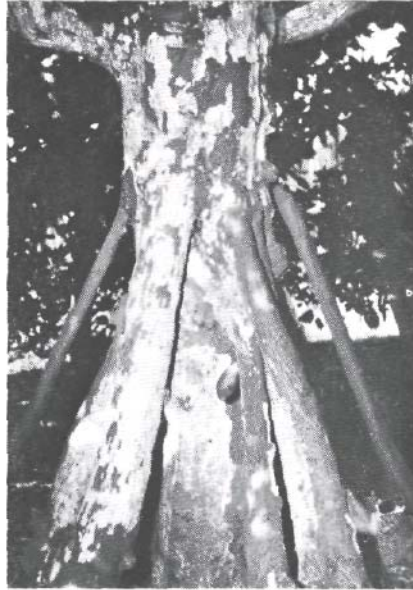
Fig. 2 Original Washington Navel orange tree in Eliza Tibbets Memorial Park, Riverside, California, forty-three years after original inarching operation.