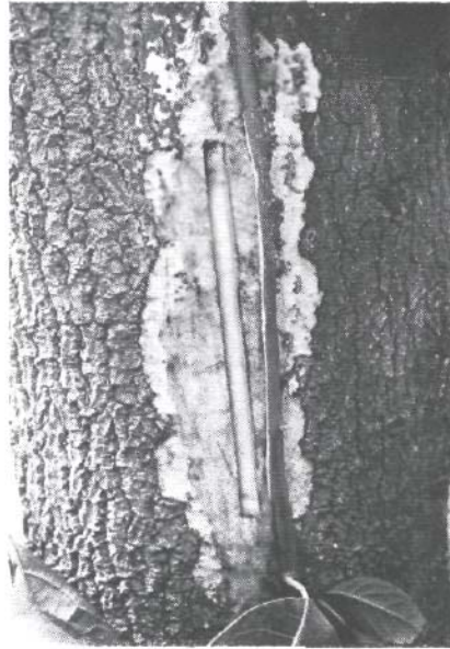
Fig. 5. Approach graft method of inarching avocados. The slot cut in the bark is approximately 8" long and as wide as the seedling used for the inarch.