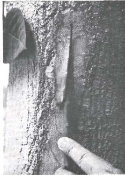
Fig. 4. Inverted T ( \perp ) inarch method on avocados. Avocado seedling is cut diagonally, and is inserted under the bark.

Since somewhat more resistance to root rot has been found in the Duke avocado than other commercial rootstocks, such as the Mexicola and Topa Topa, seedlings and cuttings of the Duke have been used almost exclusively for inarches in this project.