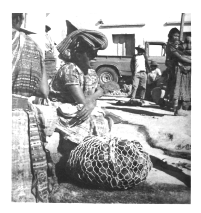
Figure 4. ''Guatemalan Criollos'' ready to go (in a net) to the market. Photographed in Patzicia-Guatemala.