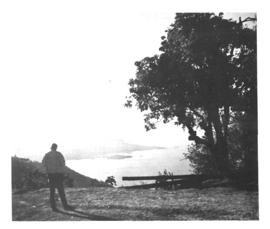
Figure 1. "Guatemalan Criollo" tree. G. A. Zentmyer in Agua Escondida overlooking another center, Cerro de Oro, at Lake Atitlán.

In Mexico, we have encountered many trees at elevations between 5,000 and 6,000 feet; and in El Salvador, mainly at 5,000 feet in the western highlands of Ahuachapán (3).