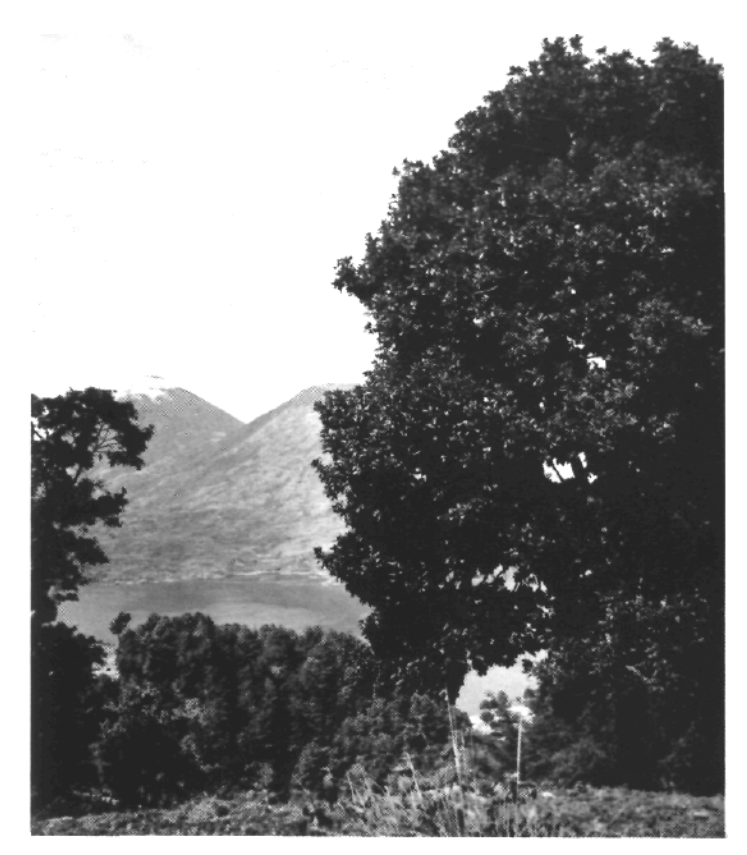
Figure 2. Guatemalan Criollo tree collection Gu-67 near road to Godinez-Sololá, Guatemala.

Department of Quiche: Quiche, Chichicastenango, Chiche, Sacapulas, Zacualpa. Department of Huehuetenango: Aguacatan, Todos Santos, San Pedro Necta. Department of Totonicapan: Momostenango, San Francisco El Alto.