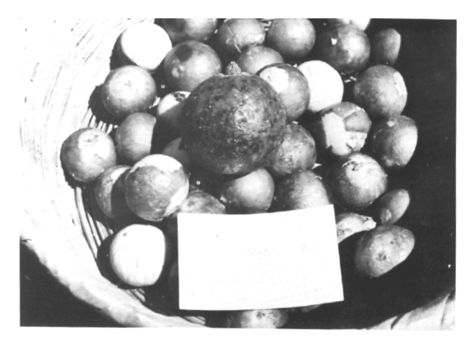
Figure 3. ''Guatemalan Criollo'' collection Gu-270, from Sacapulas, Guatemala. Note the large oblate seed.