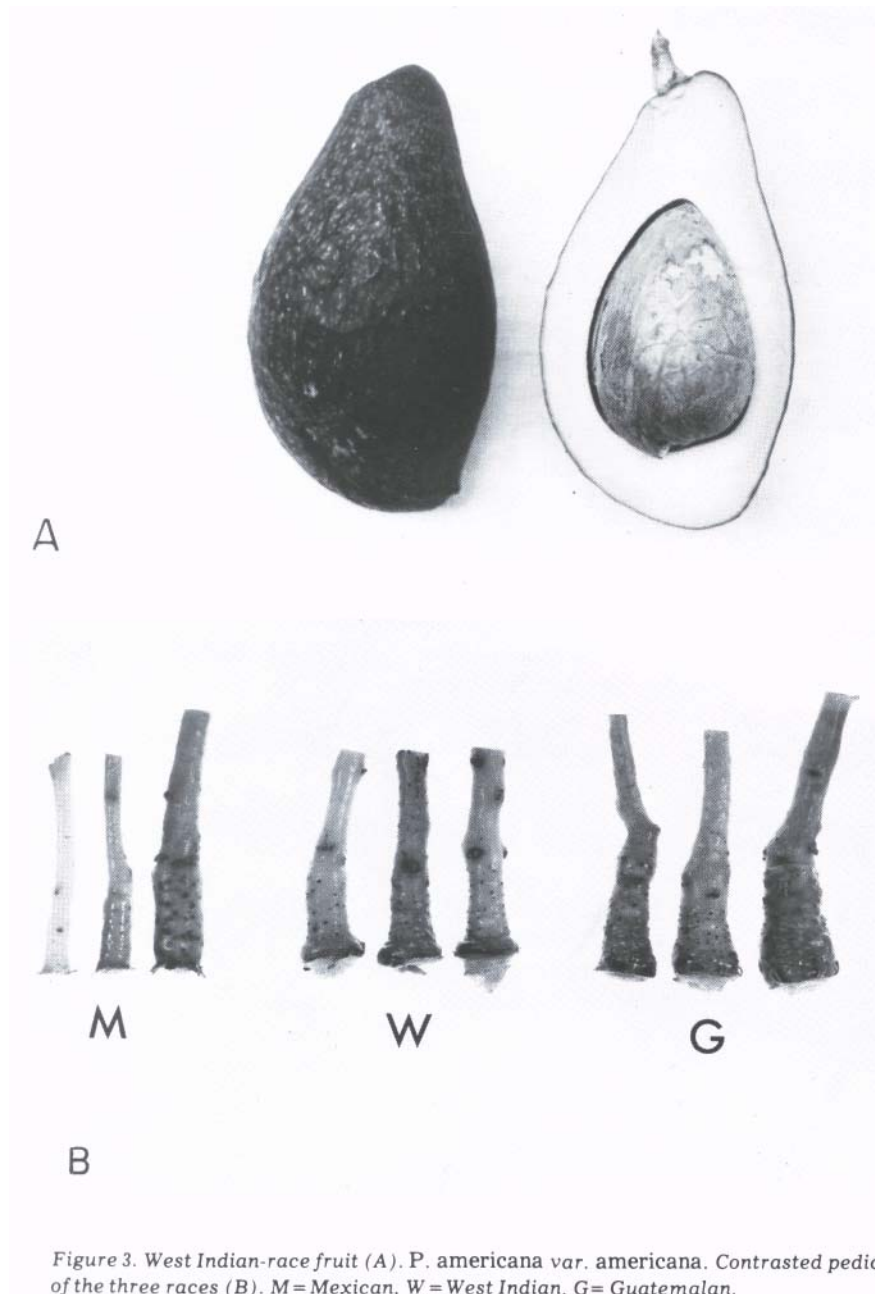
Figure 3. West Indian-race fruit (A). P. americana var. americana . Contrasted pedicels of the three races (B). M = Mexican, W = West Indian, G = Guatemalan.

However, for more tropical regions such as Florida, it serves a purpose somewhat comparable to the Mexican race for us: it itself is well adapted (it provides the early-season Florida cultivars), and its hybrids with Guatemalans bridge the two harvesting seasons, while combining good Guatemalan quality with good West Indian adaptation to tropical climates.