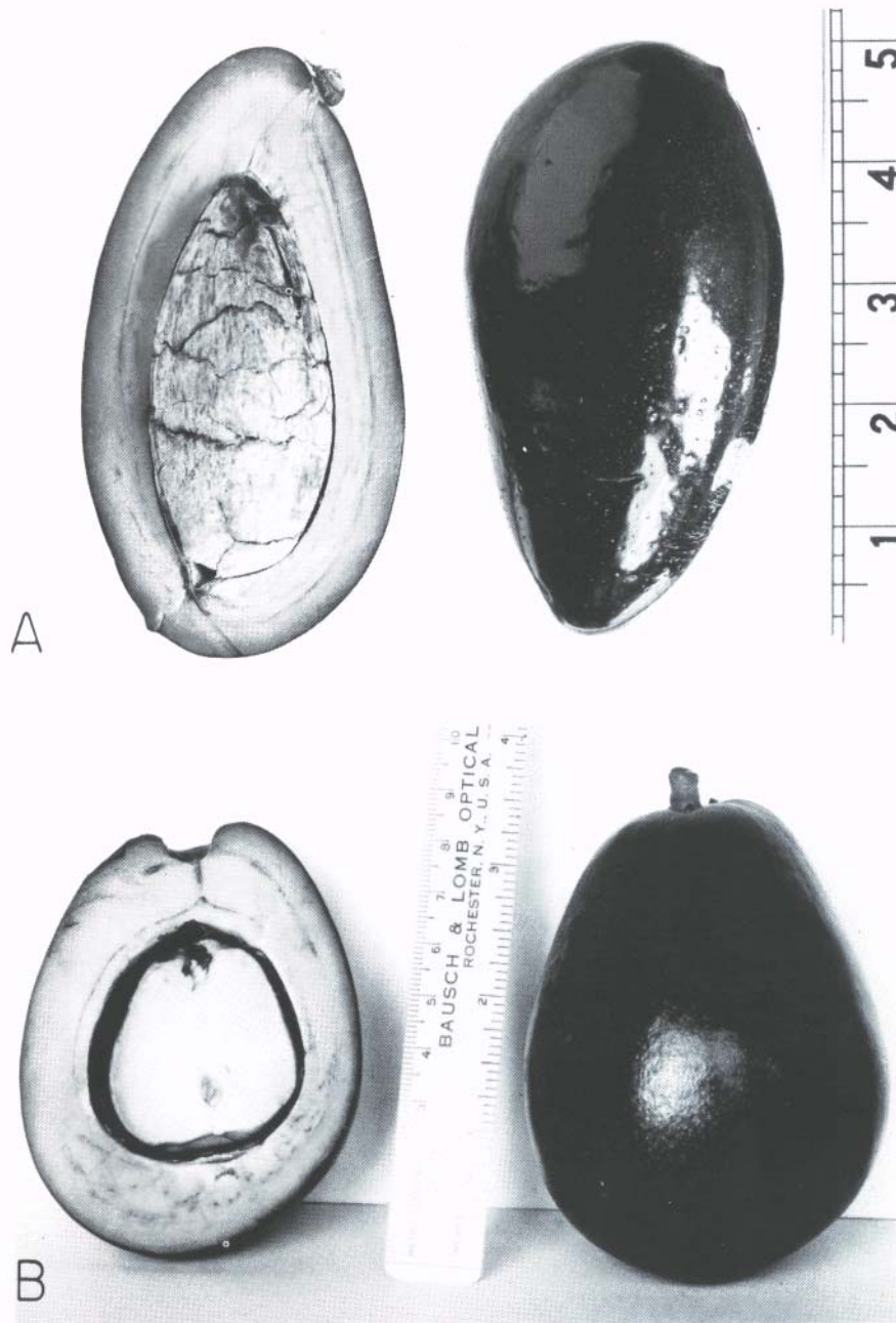
Figure 2. Mexican-race avocados. Variety Topa Topa (A) and Ganter (B). P. americana var. drymifolia .

West Indian race (Figure 3A). This tropical type is so ill-adapted to the comparative rigors of our California climate that in the pure form it will ordinarily not even flower here. Its greater salt (Table 1) and also chlorosis tolerance mean that it could be a valuable rootstock for us, but unfortunately it is ill-adapted to our cold winter soils.