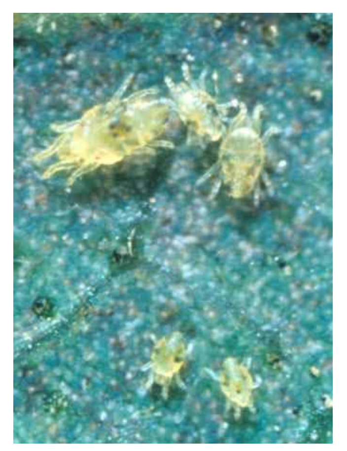
Persea mite, Oligonychus perseae

To determine the minimum release rate and release frequency, we investigated the efficacy of three release rates of N. californicus combined with three different release frequencies against O. perseae in a commercial avocado orchard in southern California. The level of control obtained by varying release rates and frequencies of N. californicus was compared to suppression of O. perseae attained with insecticidal oil applications and to population growth on trees where no control measures were implemented.