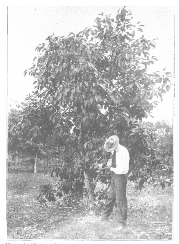
Flate I. Figure 1 Fuerte Top-worked on Seedling Stock Fifteen months' growth. U. S. Plant Introduction Garden, Miami, Florida.