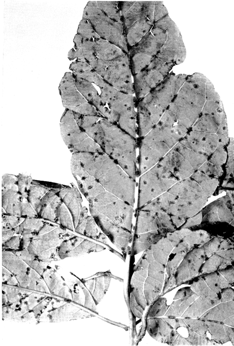
Fig. 2—Avocado scab on shoot of seedling avocado, Orlando, Florida, February 1937. Reduced.