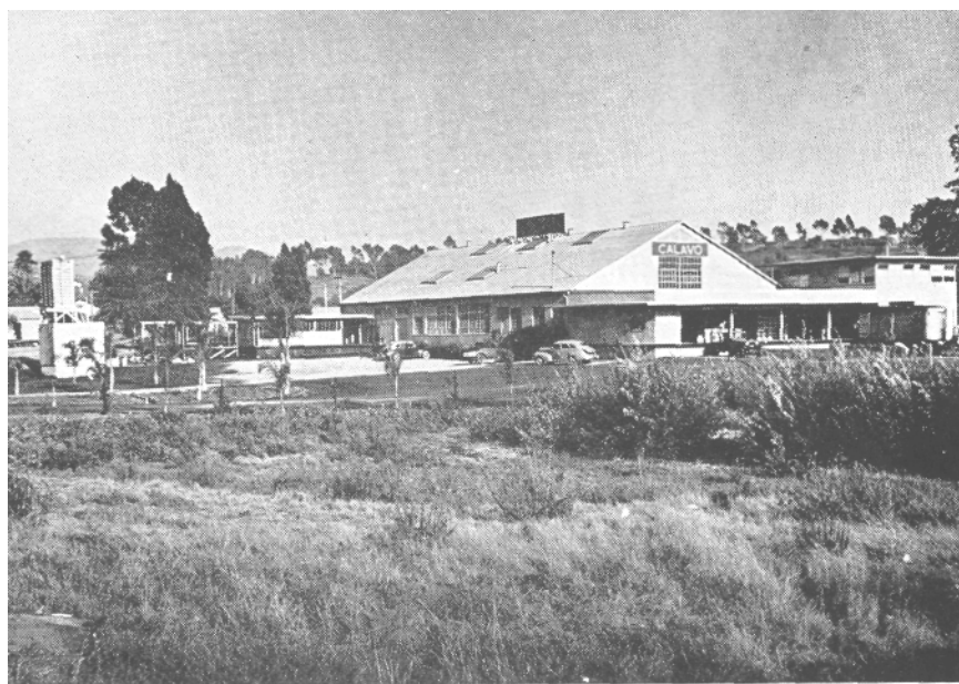
Calavo Packing-House at Vista as recently enlarged.