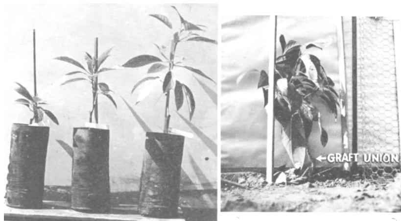
Fig. 3. Left: Tip grafts as planted. Right: Same a few months later.

As is generally known, the "tip graft" method advocated by Walter Beck* has attracted considerable attention. It consists of veneer-grafting a one-bud scion onto a young potted seedling.