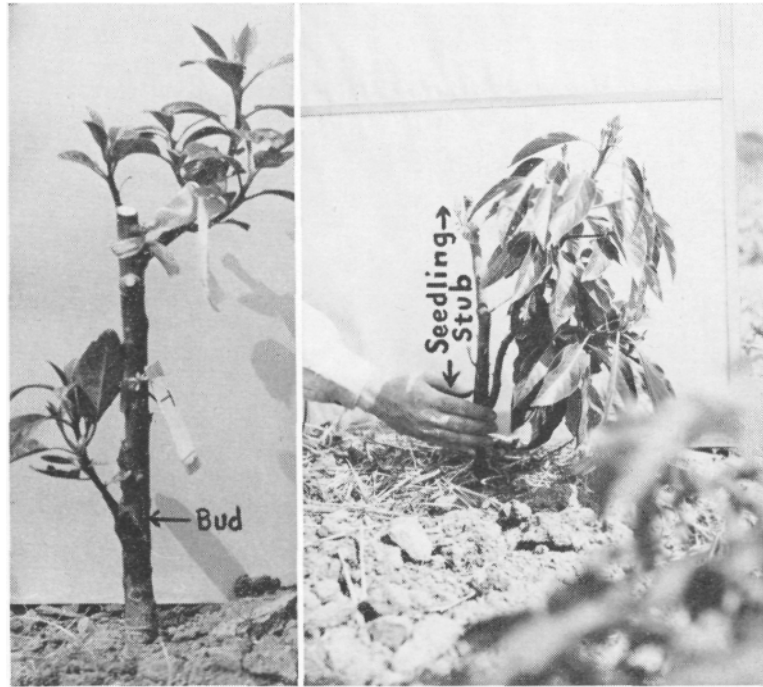
Fig. 2. Left: Tied up bud as planted. Right: Same a few months later.

seedlings, representing most of the rootstock varieties, will be allowed to fruit before they are top-worked. Since all of these seedlings are from known varieties, the outcome of this project will be watched with interest.