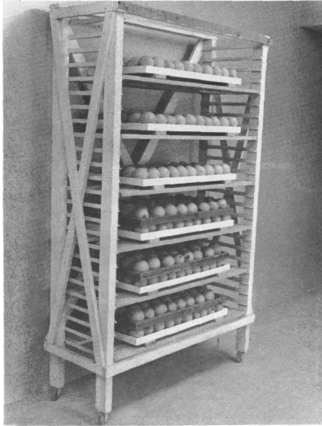
Fig. 1. A rack containing six mite units divided into two groups. One group is incubating, the other is infesting.

Each unit remains as an individual mite culture. This reduces the chance of contamination and also allows for flexibility. The following procedure represents the handling of one unit. First, a tray of DDT-treated fruit is placed on top of the tray of heavily mite-infested fruit; the mites move upward by negative geotropism onto the new fruit. Four or five days later the tray of old fruit is removed and replaced by the newly infested tray of fruit. The new culture of mites is allowed to incubate for two or three days. Then, a tray of DDT-free linted fruit is placed on top of the incubating culture. The DDT-free fruit is infested for four or five days; then it is replaced by a tray of DDT fruit, which completes one cycle. One cycle can take 11 to 14 days, depending upon the position of weekends in the cycle. The life cycle for the mite at this temperature is about 10 days. A standard flashlight is useful to determine the progress of the mite cultures. When the light is held at the proper angle, the mites and their webbing show clearly.