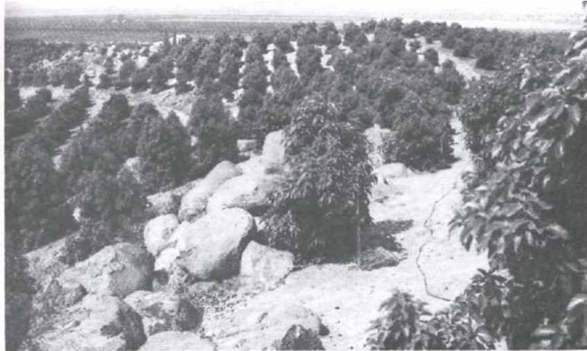
Three-year-old Zutano and Bacon trees on the Ropes-Davis Ranch northeast of Ivanhoe.

Surprisingly, two acres of Fuertes were marketed for nearly 40 years on the Case and Case Ranch near Orange Cove. Although production was somewhat erratic, the spread of avocado root rot in the orchard was responsible for the trees being pushed out about 10 years ago.