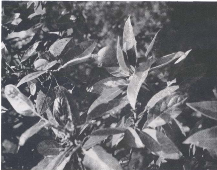
Figure 5. Leaves and green fruit of collection G-6 at the Acatenango slopes.