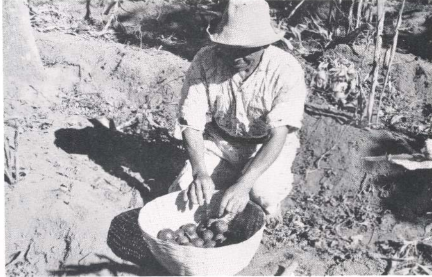
Figure 3. A Matul-oj collection from Itzapa region in Chimaltenango.