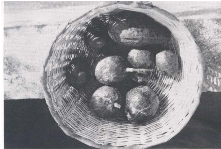
Figure 1. Different Matul-oj types collected in central Guatemala.

This word in cakchikel (a Mayan dialect in central Guatemala) means: Matul = small or little, and oj = avocado. Spanish speaking people in the region also call these types "Aguacate de Anís". All "Matul-oj's" belong to Persea americana v. drymifolia . Matul-oj's are characterized by having a very small fruit, ranging from red-wine in color to almost black in certain types. These fruit can be round, ovoid, or pear-shaped and somewhat pointed (Fig. 1). The base of the fruit where the peduncle starts has the persistent perianth segments. The other characteristic is the anise odor of the leaves when these are crushed, also sometimes the green fruit. On the underside, leaves show a bluish-green color. Trees even when old are broadly spreading and do not become very tall.