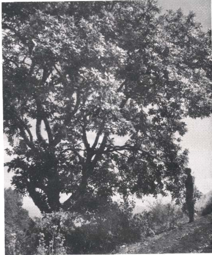
Figure 4. Tree of collection G-6 of Matul-oj on the slopes of Acatenango volcano.