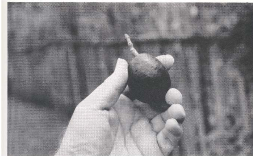
Figure 2. Collection Gu-165, a Matul-oj collected at Malacatancito, Huehuetenango.

plantings is where we have located trees of "Matul-oj" or Aguacate de Anís.