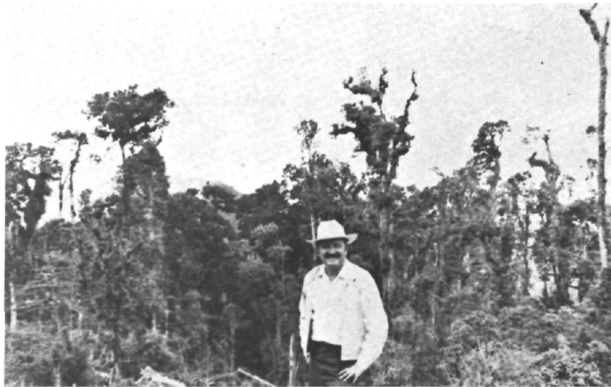
Fig. 3. One of the authors, collecting in Costa Rica where Quetzals as well as Persea are found.

Certain "Aguacatillos" constitute the food for the Quetzal. However some of these wild trees are not the true Persea but belong to the genus Phoebe or Nectandra (4). Guatemalans believe that only "Aguacatillos" constitute the food for the Quetzal, but we know that not only members of the Laureaceae produce fruit for this bird, but also trees in some of the other families in our American tropics.