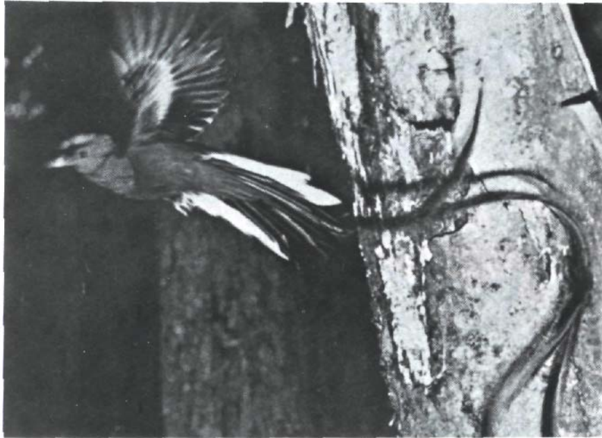
Fig. 2. A Quetzal (male) in flight.

a cage. Skutch described the Quetzal with the following words: "The males are glittering green or violet or blue on the upper parts, with red or vermilion or yellow on the abdomen. With their bright plumage, proud upright posture, gentle dignified manners, and the mellow notes of most species, they are exceptionally attractive birds, the perfect gentlemen of the avian community." The Quetzal can be rarely seen from Chiapas, Mexico down to the isthmus of Panama, where we have in recent years been exploring for wild avocados. Its habitat is the same as where we have collected Persea species in tropical America. We should, however, stress that in some higher mountains of this habitat we also encountered some of the wild species of avocados. The Quetzal lives then in the warmer range of this belt where we have explored for Persea .