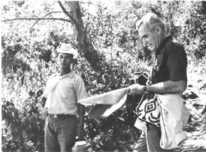
Fig. 1. Therefore we have to explore the Quetzal country....

Professor, Department of Plant Pathology, University of California, Riverside