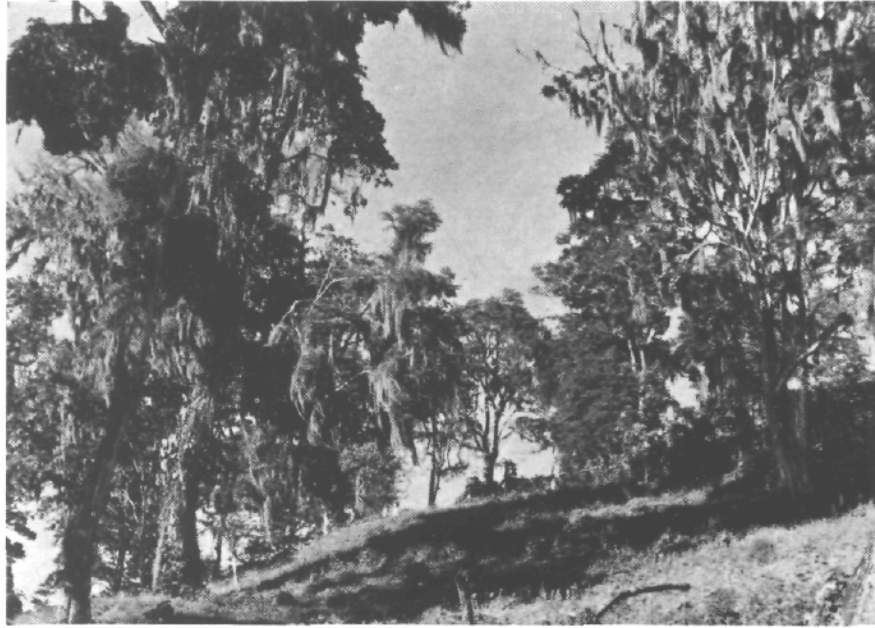
Fig. 4. Montane forest of Sta. Maria de Ostuma in Nicaragua provides the right habitat for Persea and the Quetzal.