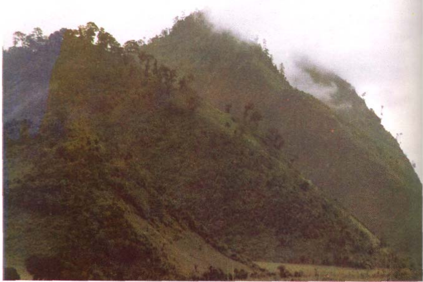
Fig. 1. Purulhá region of Guatemala, where P. zentmyerii was collected.