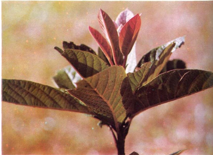
Fig. 2. P. zentmyerii foliage, showing the large size of older leaves, the reddish color of young leaves.