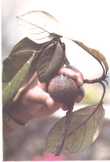
Fig. 3. Foliage and fruit of P. zentmyerii . Note the coarse leaf venation, and the corky fruit ridging.