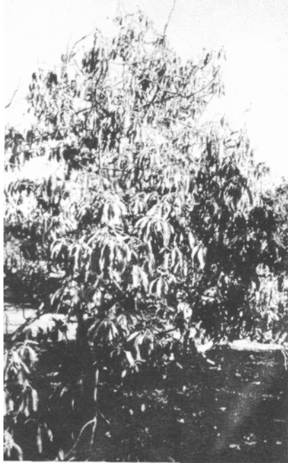
Fig. 1. Typical severe symptoms of Phytophthora citricola on a Hass avocado. The foliage is chlorotic and branch die-back is occurring.