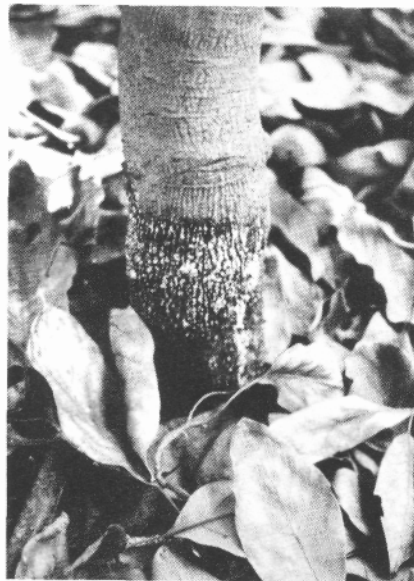
Fig. 3. Symptoms of Phytophthora citricola on a 2-year-old tree. A collar rot is present which completely encircles the tree trunk.