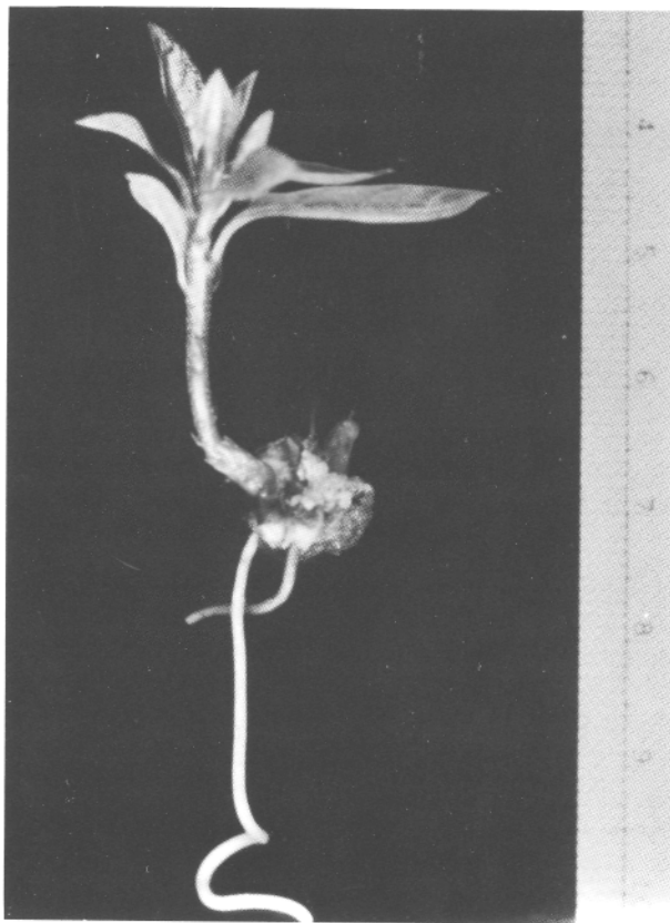
Figure 4. Rooted shoot in MS containing IBA before transfer to soil.

This procedure showed that embryonic axes of mature avocado respond to the increase of cytokinins and produce multiple shoots with high frequency. More improvement of the percentage of rooted shoots and recovered plants in soil would make it possible to accomplish rootstock cloning and advance avocado breeding.