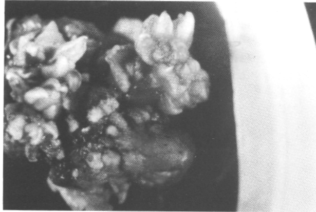
Figure 3. Multiple buds and callus formation in a medium containing Thidiazuron.