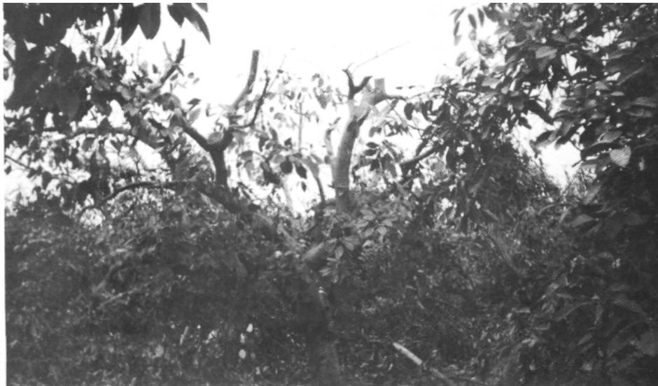
Figure 4. Orchard in Israel undergoes first severe hedging and topping to reduce tree size.

This is a fairly new program for them. In effect, they are removing one year of tree growth to maintain tree size. These trees continue to fruit. Harvesting efficiency is their main reason for pruning. Most Israeli groves are 25-30 tall before the initial pruning. That first pruning can remove half of the foliage and severely reduce production. The major advantage of this practice is that it is mechanical, requiring low labor input ( Figure 4 ).