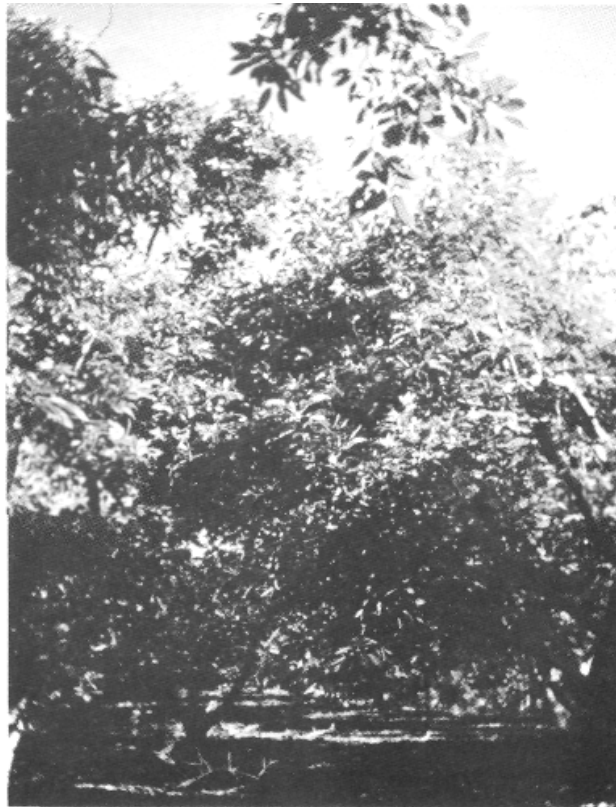
Figure 1. Avocado orchard before “two branch” pruning.

Most California avocado growers have a problem. It is actually a problem of avocado growers around the world: The darned avocado trees just keep growing! All of us accept the fact that avocado orchard thinning, in one form or another, must be done. Eventually, half the trees will be removed, giving twice as much room for the remaining trees. Granted, in California this initial removal of every other tree might finally happen when the remaining trees are twenty years old. Usually, by the time the orchard thinning is completed (3 to 5 years), one-half to three-fourths of the trees are crowded again ( Figure 1 ).