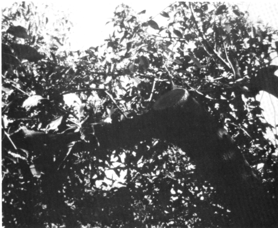
Figure 5. Opening the interior of a 40 year old tree.

In Australia , grower Graham Anderson pruned 30-foot tall, 25-foot wide trees that had not yet lost their side branches. The grove had had the initial 50% tree removal thinning. His objective was to open the center of the trees by cutting out about half of the major branches—the tallest and longest branches—leaving the other branches untouched. The unpruned branches continued to bloom and fruit. One year after the pruning, some of the new interior branchlets had grown, and some had set fruit Figure 5 ).