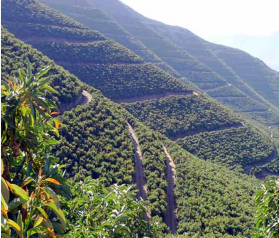
Figure 7: Seven year old 3x3 m with multiple aspect

Another advantage of planting in square patterns is since it is meant to work with individual trees and not rows, it is not necessary to design the orchards with rows in a north-south orientation. This can be especially difficult on hills with slopes with multiple exposures and where ridges have to be built to increase soil depth and drainage (Fig. 7).