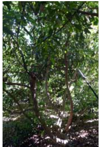
Figure 9: 6x6 m overcrowding.

Newly planted Hass trees habitually tend to grow as a central leader. This structure is lost after a rest of growth which is followed by regrowth where lateral or basal shoots are vigorous and begin to compete with the initial central leader. This produces wide, big canopies with significant shading in the interior. Thorp and Sedgley (1992) studied the growth habit in avocados describing the occurrence of proleptic (vigorous) and sylleptic (weak) shoots. Semi dwarfing and upright varieties such as Reed and Edranol produce weak lateral growth, mainly based on sylleptic shoots, whereas varieties like Hass produce vigorous proleptic shoots that compete with the central leader. This habit in Hass forms large lateral structures causing the loss of the central shoot's dominance and resulting in a wider tree structure with great shading in the interior of the tree (Fig. 9). In the case of densely planted