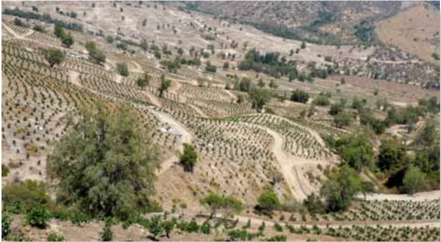
Figure 16: Ten month old 2.5x2.5 m

season to season. This is partly because the selection of shoots in the first year that made trees grow in a more balanced way and do they not use the total available space as fast. At Llayquen, trees are more compact, and 6 years after planting, the trees are just covering the available space. Based on this experience, new trials with planting distances of 2.5x2.5 m (8.2x8.2 ft) have been planted. This implies a 45% increase in the number of trees per hectare (1,600 trees/ha), which will of course have an important effect on orchard precocity (Fig. 16).