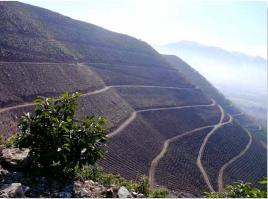
Figure 12: First year showing road system