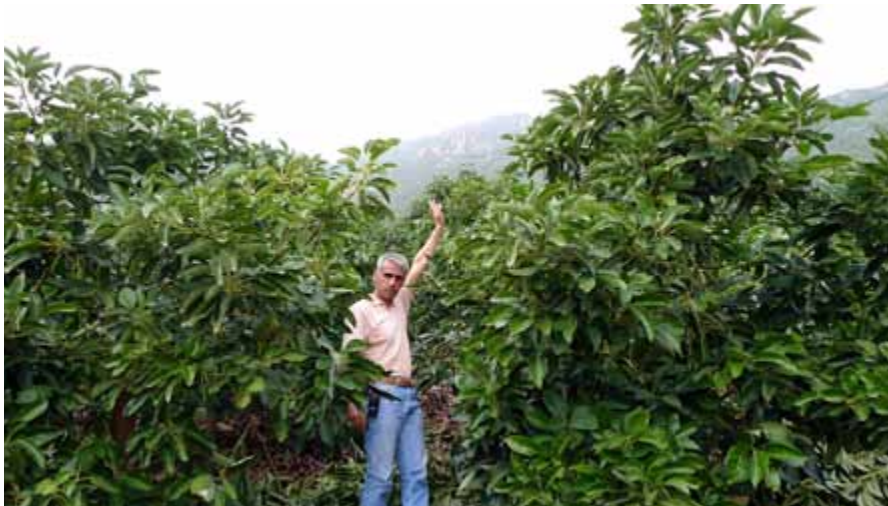
Figure 20: Pruning in DASA 3x3 m

In relation to orchard design, there are ongoing research efforts to evaluate alternative tree structures with the goal being to achieve efficient canopy lighting and develop foliage renewal forms that are more balanced and less invasive. Also, new pruning systems have to be easy to understand and perform at a practical level, something that is easier when it's not done severely (Fig. 20). In relation to the spacing issue, we think that distances of 2.5x2.5 m could be well adapted to trees formed on a central leader. New trials are beginning that will test even higher densities to further increase orchard precocity, increase root competition to reduce vigor and pruning interventions, and have a simpler tree structure.