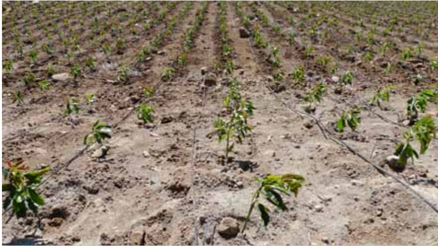
Figure 18: 1.25x1.25 m

rently we are testing even higher densities, with spacing such as 1x1 m, 1.25x1.25 m, 2.5x1.25 m among others (Fig. 18).