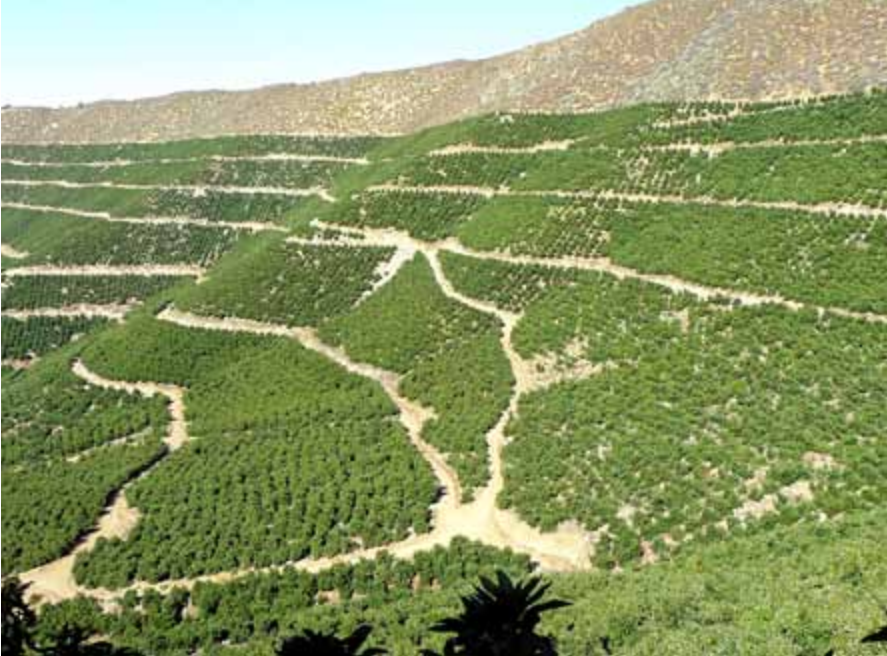
Figure 13: Five year old 3x3 m