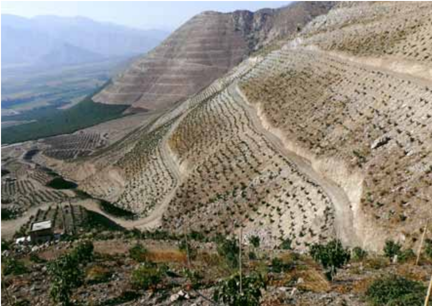
Figure 2: Year one trees on steep hillside

larger size of farm units, climatic conditions favorable for fruit set and reduced frost risk, and earlier maturity dates. This provides the possibility of planting in early inland areas where it is common to have frost in the piedmont and lower valley areas. The problems of these hillside plantations are: the high cost of energy related to water pumping (Chile has one of the highest energy costs in South America), the need for adequate labor, soil heterogeneity and reduced soil depth. We estimate that currently there are at least 18,000 hectares planted on slopes steeper than 30%, or 45% of the countries' total (Fig. 2)