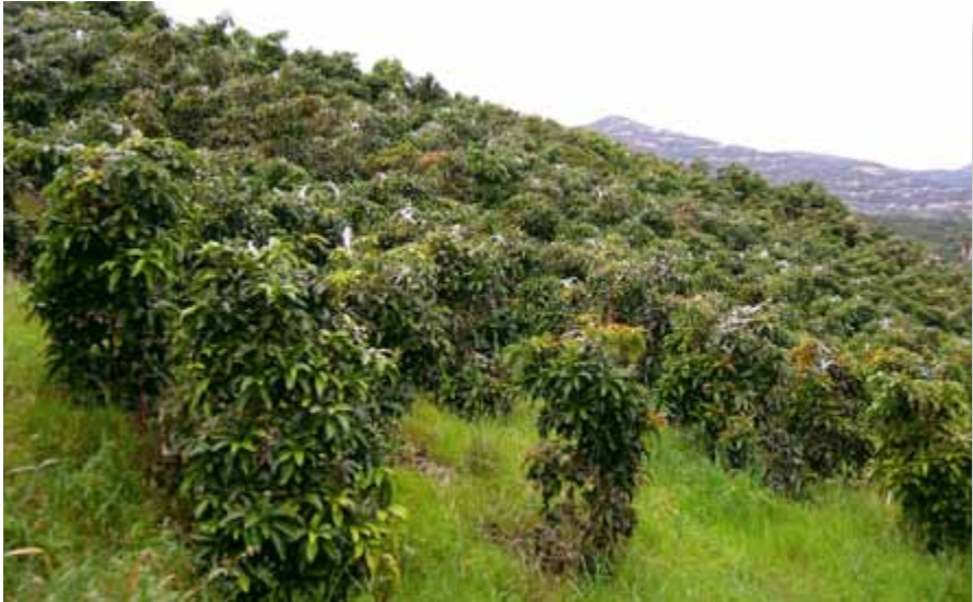
Figure 8: Reed at 2.25x2.25 m in California

density systems with minimal pruning compared with varieties with vigorous and extensive growth habits like Hass (Fig. 8).