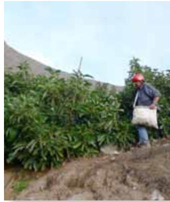
Figure 19: Picking 3x3 m

Based on those principles, management of high density production systems is more dependent on external inputs, but on the other hand, the use of these systems has shown to have a direct positive impact on quality and safety for labor, uses less nitrogen and water, and offers better economic results (Fig. 19). The more efficient use of resources is even better expressed if it is considered by the kilogram and not by the hectare.