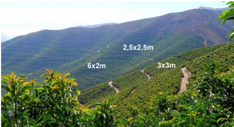
Figure 15: Llayquén

This experience showed the importance of maintaining the initial structure for the long term, preventing excess of vigor and shading. Alternate bearing could be reduced with tree management, requiring especially judicious production reduction in “on” years. This is not necessarily better from the economic point of view nor something growers do easily, but is a practice we are currently working on, with the aim of reducing alternate bearing.