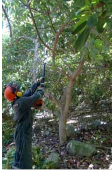
Figure 3: Pruning in 6x6 m trees

To address the above challenges, the use of pruning has become a common management practice in Chile and its aim has been to manage more compact trees, making management easier, allowing more consistent production and better fruit size (Fig. 3). In the case of new plantings, the use of high density systems has been the answer to obtain better productive and economic results.