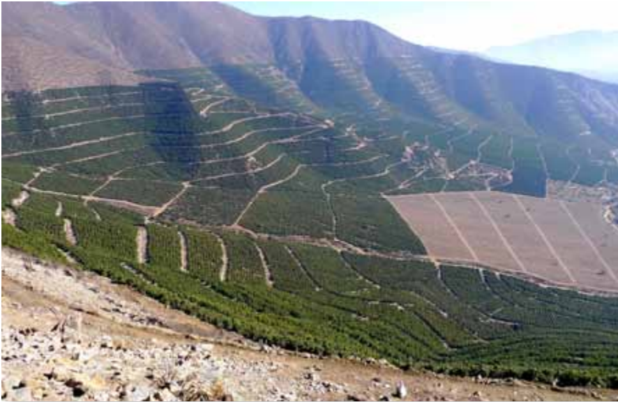
Figure 1: 6 year old 3x3 m 300 ha Grove

Official data on avocado plantings in Chile measured 7840 hectares in 1987, increasing to 17,047 hectares in 1997, and to 39,255 hectares in 2007 (FAOSTAT 2010). (1ha =2.47 acres) New development has been markedly reduced since 2009 due to severe drought conditions, which has been worse during the 2011/2012 season. Additional factors that have limited growth are frost problems (mainly in 2007, 2010 and 2011), availability of quality land, increasing costs (especially energy and labor) and the global economic crisis, which has provided a greater level of uncertainty for investment. However, market prices for avocados have remained attractive despite the increases in volume, where production has increased from near 55,000 metric tons in 1997 to 250,000 metric tons in 2007 (FAOSTAT 2010). Due to growth in consumption in traditional markets and the development of new ones, economic results for well-managed orchards are still very attractive. Similar to other avocado producing countries, domestic consumption has increased coupled with substantial increase in grower's returns.