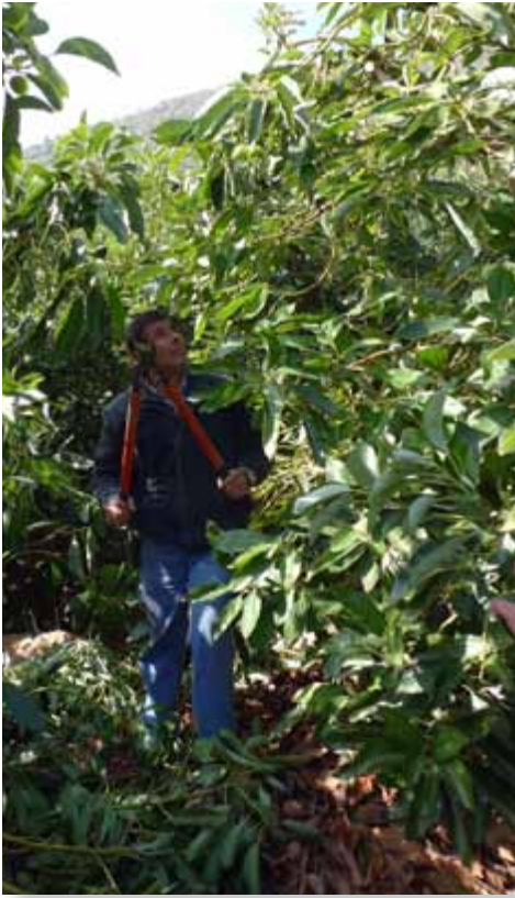
Figure 10: 3x3 m young tree pruning

Hass trees this growth tendency requires initial shaping during the first growing season, with pruning and branch selection. In later years, pruning consists of maintaining tree height and lateral growth to the trees' assigned space, and pruning weak branches to ensure light penetration by making small "holes" in the canopy (Fig. 10). In some years, selective pruning is needed to maintain the structure's initial shape and to correct any development of lateral vigorous branches and other problems related to light interception. The use of plant bio regulators (PBRs) after pruning in subsequent year to control vigorous regrowth could be of great help, because it greatly reduces the need for pruning.