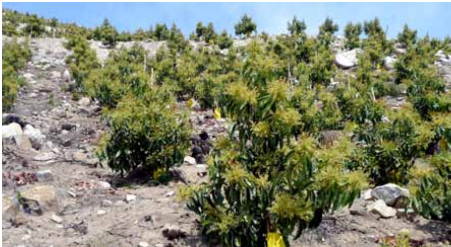
Figure 14: Second year flower

These results show the precocity of orchards planted in high density systems. If an orchard is planted early in the season (like in this orchards case that was planted in August at the end of winter in the southern hemisphere), it is possible to form the structure (2 m high central leader with lateral shoots) in the first season, then induce the tree to flower the following spring (October), and harvest the next spring 24 months after planting (Fig. 14).