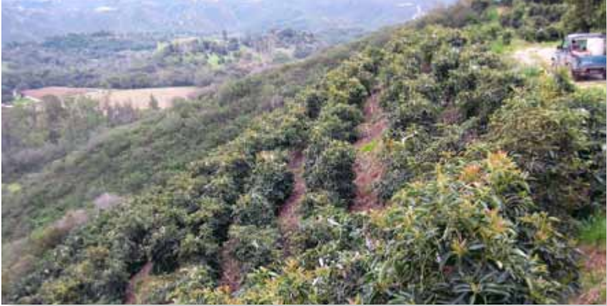
Figure 5: Lamb Hass at 2.25 x 2.25 m in California 2002

increase the efficiency and safety of workers, and to lower costs (Fig. 5). This system also proved to be more precocious and productive. The idea