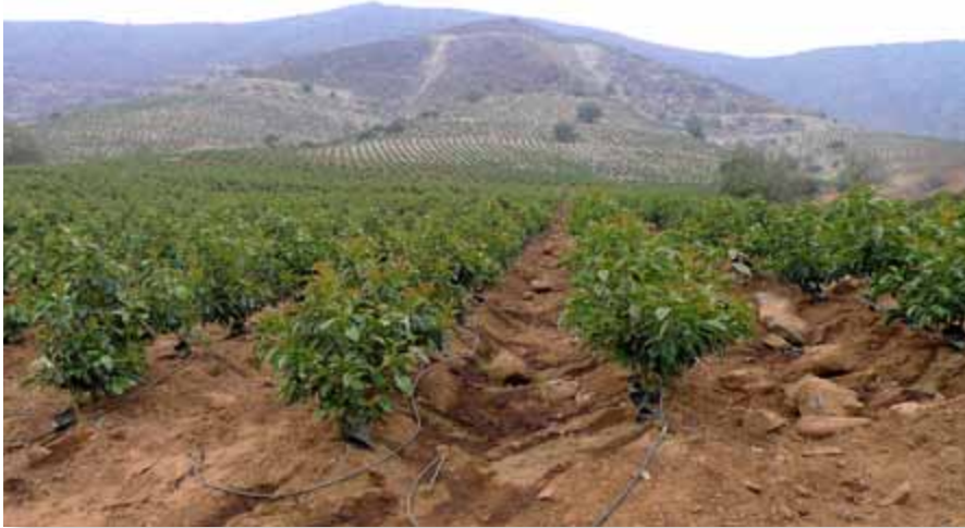
Figure 11: Closeup of 2.5x1.25 m on ridges.

promoting drainage (Fig. 11). This implies a restriction on soil available volume for root growth additionally affecting tree vigor. Another factor that facilitates the control of tree growth is the concentration of rainfall only in only the winter months, when plant activity is slower. This provides further root growth restriction, especially when this is also managed by controlled irrigation practices. In high density plantings, most trees are irrigated by Microjets (when using ridges) or short range Microsprinklers (without ridges). Drippers are used to a lesser degree, and when used they are normally spaced at 50 cm from each other.