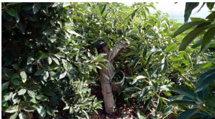
Figure 17: Picking in 3x3 m