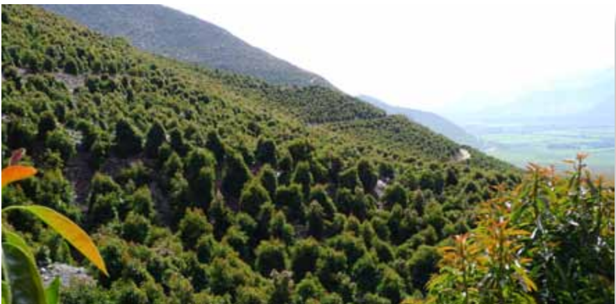
Figure 6: Five year old 3x3 m showing pyramidal shape

is to work with individual trees with a central leader structure not taller than 2 m and a pyramid-shaped canopy, allowing for good illumination all around the tree, unlike rectangular standard plantings that eventually form a hedge with only two sides illuminated and productive (Fig. 6).