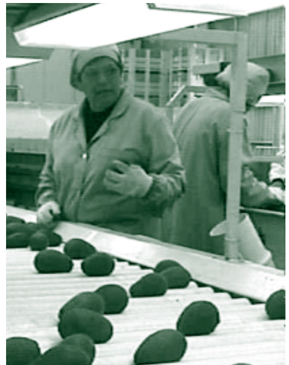
Fruit packing and grading utilizing HACCP standards at Safex Packinghouse near Quillota, Chile.

advisors recommend 11% of the total planting to be planted to pollinizers. What is unusual about Edranol is that, although a well-liked fruit, it produces very little if any fruit but flowers profusely in Chile, every year; it is planted strictly for pollination purposes. There is a lesson to be learned by California avocado growers who have been struggling with which variety of 'B' flower trees to plant. The Chilean argument is that Edranol is such a good pollinizer that the increased production of the surrounding Hass trees more than compensates for the Edranol's lack of productivity. In California, the search for replacement to the traditional pollinizer varieties by Hass-like varieties is somewhat misdirected. The foremost purpose of a pollinizer variety is to do the best job providing abundant quality pollen. Zutano, and to a lesser extent Bacon, are well suited to do the job!