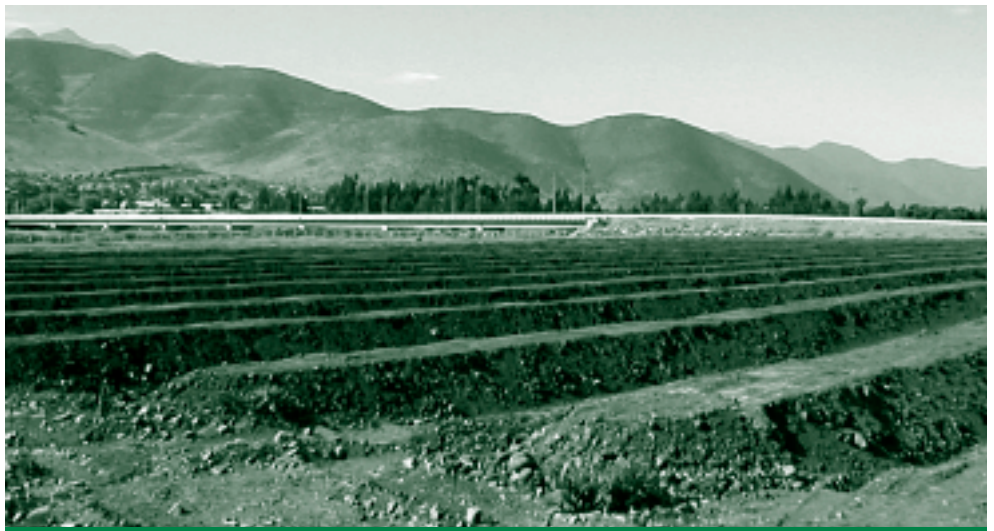
Preparation of ridges prior to planting of new avocado grove in Chile.

Comité de la Palta is the equivalent of the California Avocado Commission ('Palta' is the term for 'avocado' in Chile). It is a private organization formed in 1991 under the sponsorship of the National Federation of Fruit