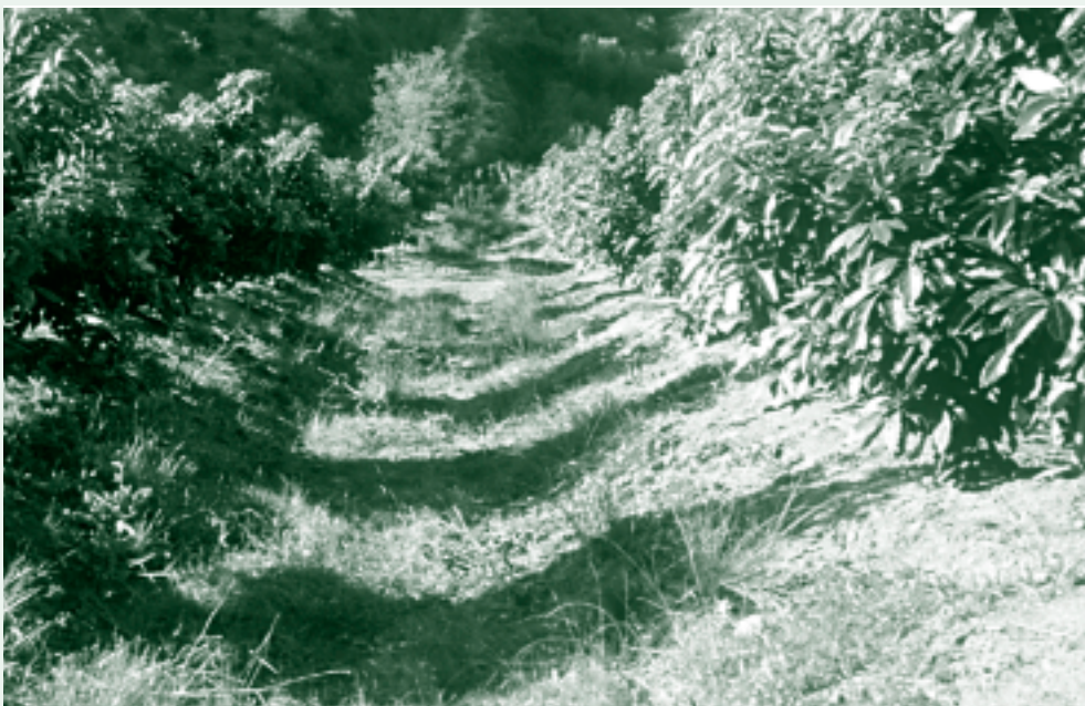
Hass avocado trees planted on ridges going downhill in Chile.

In the long term, the Chilean Hass industry is hoping to find an important market alternative in South America, especially in Argentina. This option has been long contemplated, and test shipments have been made to that country. The high prices obtained in other markets, coupled with the economic problems and informal way of doing business in Argentina, have limited the development of this market. Compared with Chilean avocado consumption, Argentines consume a little more than 0.5 lb per capita. With the population of metropolitan Buenos Aires and suburbs approaching 13 million, it is obvious that the growth potential of this market is enormous. Although Argentina, Peru and South Africa are in the same hemisphere as Chile, their avocado harvest seasons are different from Chile's and thus they complement each other. The availability of fruit throughout the year is a critical component in developing a