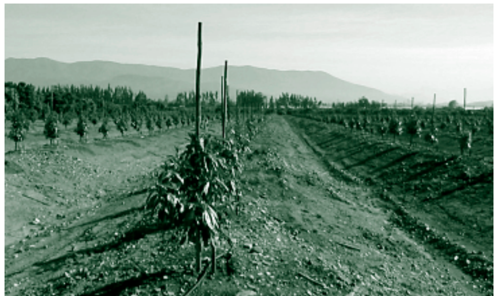
Newly planted avocado trees on ridges in Chile.