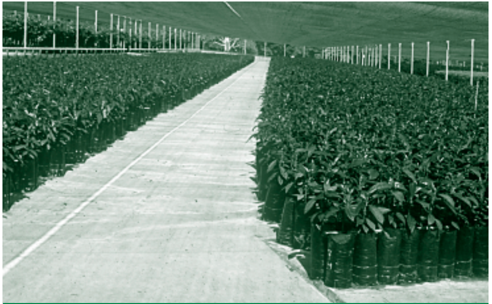
Propagation of avocado trees at the Huerto California Nursery near Quillota, Chile.

The first significant shipment of 6 million lbs of Chilean avocados arrived in the U.S. in 1986 as the U.S.