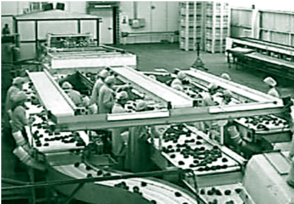
Overview of fruit grading using HACCP guidelines at Safex Packinghouse near Quillota, Chile.

year, when commercial harvest commences, a grower with a 25-acre grove will have invested around $4,000 per acre.