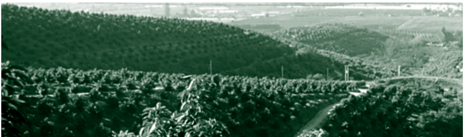
Hass avocado plantings near Quillota, Chile.

Irrigation water comes from two rivers that flow above ground only intermittently. Water availability is a limiting factor since the mountains supplying these valleys are not as extensive and are not as high as other ranges that provide water for agriculture in Chile. Therefore, 95% of the groves are irrigated using either shallow or deep wells. Almost all growers irrigate via pressurized irrigation with a preference for microsprinklers. Water quality is good, with electrical conductivity (EC) of 0.4 decisiemens/meter (dS/m) (Colorado River water, in contrast, is 0.9 – 1.0