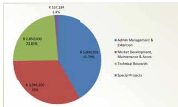
Figure 2. SAAGA expenditure in 2015/16.