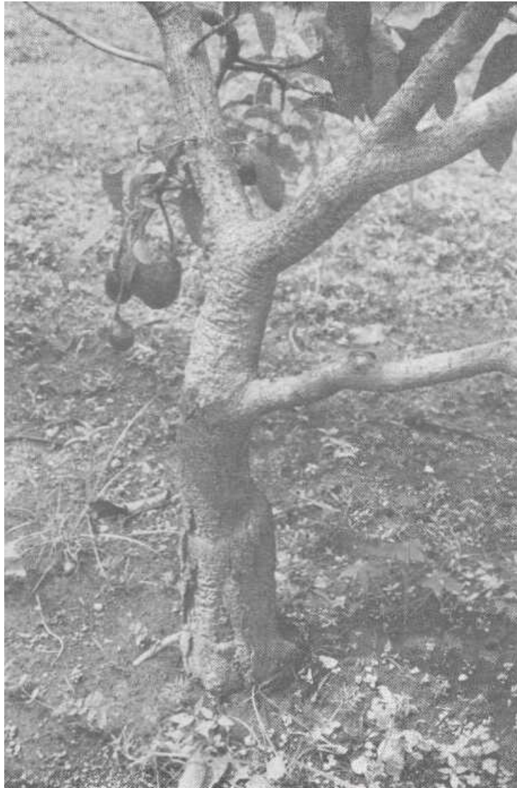
Figure 1. Typical canker caused by Phytophthora heveae on young avocado tree in Guatemala.

Isolations were made by the senior author using small pieces of bark from the active margins of the lesion on the lower trunks of the small trees. Bark pieces were plated on media selective for Phytophthora in an improvised hotel room laboratory in Antigua the day of collection. Isolations were made again from the same planting in 1974 and 1977.