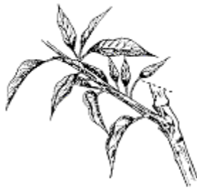
Figure 2 - After T-bud begins to grow, remove nurse branch