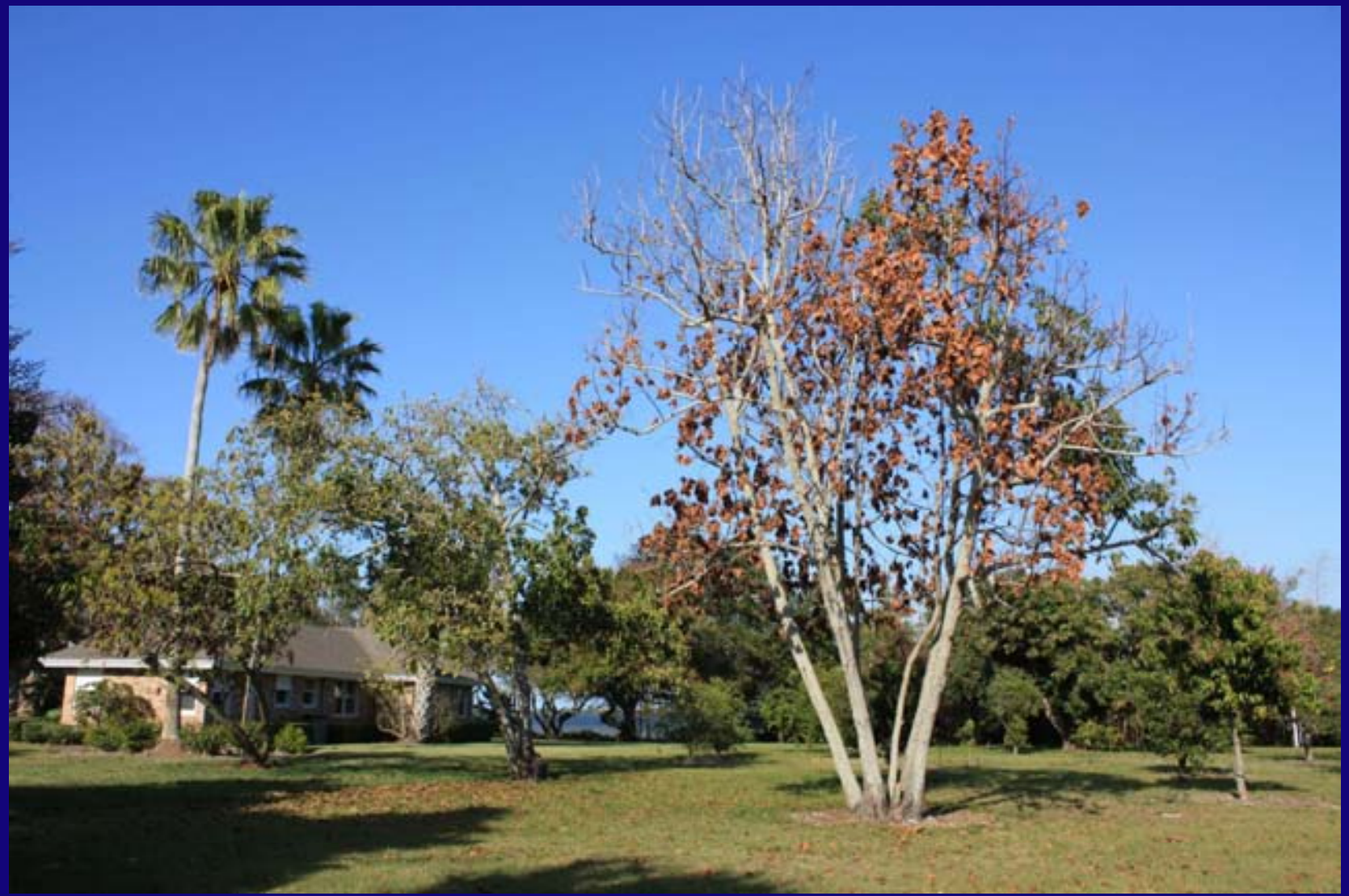
Laurel wilt disease caused by Raffaelea sp. on backyard avocado trees in Florida