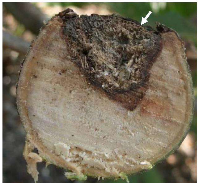
Fig 3. Dothiorella perennial canker on branch

However, recent studies based on DNA analyses suggest greater species diversity of this pathogen group than based on morphological characteristics alone. Thus far, multiple species of Botryosphaeriaceae have been found to cause the typical Dothiorella canker (Fig 3, 4) and stem-end rot (Fig 5), leaf scorch (Fig.6) on avocado in California. Percent recovery of Botryosphaeria spp. based on morphological characters ranged from 40-100% in Riverside county, 42-53% in Ventura county, 33% in Santa Barbara county, 60% in San Diego county and 32-60% in San Luis Obispo county.