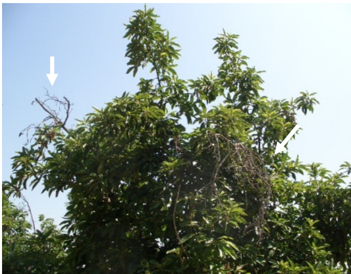
Fig. 1. Dothiorella branch dieback and canker symptoms on Hass cv. avocado tree.

According to preliminary results from a continuing survey throughout avocado growing areas of California, multiple species of Botryosphaeria ( Neofusicoccum australe , B. dothidea , N. luteum , and N. parvum ) were found.