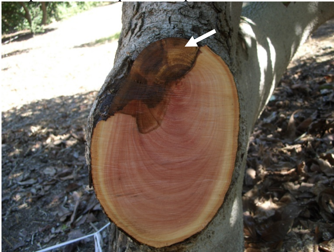
Fig 4. Dothiorella perennial canker on trunk

old diseased avocado tree branches. Sequenced rDNA fragments (ITS1, 5.8S rDNA, ITS2, amplified with ITS4 and ITS5 primers) were compared with sequences deposited in GenBank.