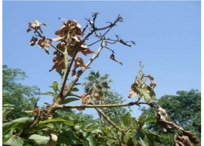
Fig. 2. Dothiorella branch and shoot dieback symptoms on Hass cv. avocado tree.

Branch and trunk canker on avocado was formerly attributed to Dothiorella gregaria , hence the name Dothiorella canker. So far Botryosphaeria dothidea (anamorph: Fusicoccum aesculi ) is the only known species causing Dothiorella canker on avocado in California. Symptoms observed on avocado with Dothiorella canker include shoot blight and dieback, leaf scorch, fruit rot, and cankers on branches and bark (Fig.1, 2, 3).