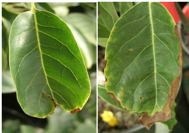
Fig 6. Leaf scorch symptoms of Dothiorella canker

Pathogenicity tests were conducted in the greenhouse on 1-year-old avocado seedlings, Hass cv., with one randomly chosen isolate from each of the Botryosphaeriaceae species noted above. Four replicate seedlings were stem-wound inoculated with a mycelial plug and covered with Parafilm. Sterile PDA plugs were applied to four seedlings as a control. Over a period of 6 months, seedlings were assessed for disease symptoms that included browning of leaf edges and shoot dieback. Mean vascular lesion lengths on stems were 64, 66, 64, and 18 mm for B. dothidea , N. parvum , N. luteum , and N. australe , respectively. Each fungal isolate was consistently reisolated from inoculated seedlings, thus completing the pathogenicity test. To our knowledge, this is the first report of N. australe , N. luteum , and N. parvum recovered from branch cankers on avocado in California.