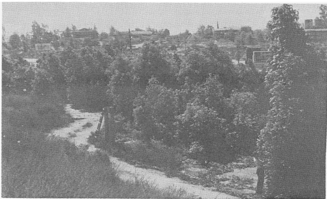
Fig. 4. Avocado hybrids growing at the Citrus Experiment Station. These trees vary from three to five years of age. The particular hybrid being examined in this photograph is the only tree on the Station producing fruit with a red-colored skin — both parents were green-fruited.

To date, some 1,200 seedlings of known parentage have been produced at C.E.S. It is felt that this number is quite inadequate, so an accelerated breeding program is planned for the next few years. A shortage of land on which to plant out these hybrids has apparently been largely solved by arrangements that are being made to set out the trees as a screen, or landscape planting, or windbreak, on various suitable private and public properties in Southern California.