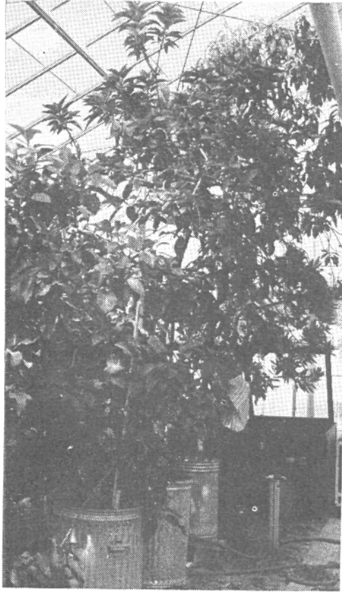
Fig. 2. Greenhouse trees. The four visible in the front row are Zutano, Bacon, P. skutchii and P. borbonia . Zutano and Bacon are newer experimental varieties with very hardy trees and also consistent production — unfortunately the fruit quality of both leaves much to be desired. They are probably of Mexican-Guatemalan hybrid origin.

A much less expensive method of producing self-fertilized seed is through the use of isolated trees as described in the discussion of the U.C.L.A. breeding program. In the absence of definite information concerning bee and other insect behavior in avocado groves, we have established a rather arbitrary necessary separation of about 150 yards. Limited evidence indicates that, at least in some areas, this is several times what the distance would need to be to reasonably rule out the cross pollination danger. Suitable orchards of the various desired varieties are scarce, so we are arranging with certain growers of other crops to set out three or four trees of each variety in good isolation.