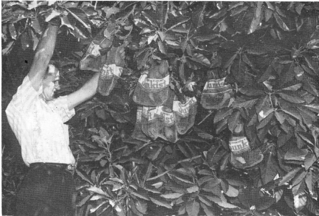
Fig. 3. Mesh bags around hybridized fruits produced by hand pollinations. The tree is a Nowels (Mexican-Guatemalan hybrid). Zutano was the pollen parent used. Approximately 160 fruits matured, the largest number of hybrids yet obtained from hand pollination of a single tree.

have tested even as greenhouse flowers that are not pollinated have never matured a fruit. After the tree is through blooming the cheesecloth bags are replaced with open mesh bags. (figure 3)