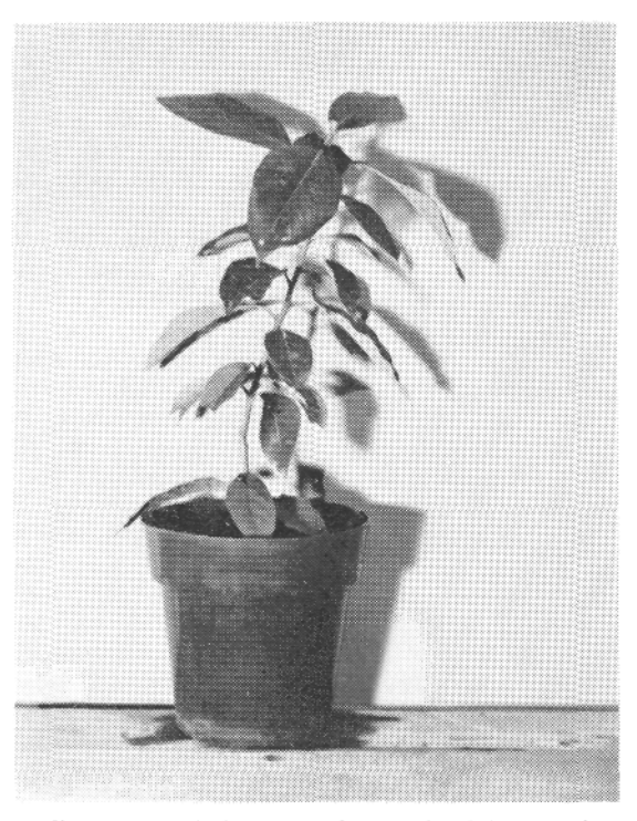
Figure 2.—Typical avocado plant produced from cuttings (about 6 months after potting).

<sup>2</sup>Remainder included 23 percent callused but all leaves gone and 51 percent lost from rotting.