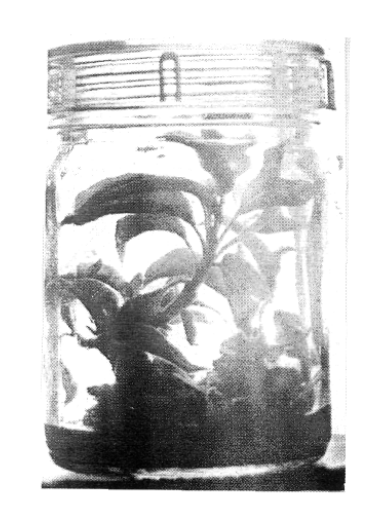
Figure 2 In vitro multiplication of Duke 7 microshoots. Plants produced 4,5 new leaves over an 8-week growth period

Successful in vitro initiation and multiplication of Duke 7 avocado plants was obtained. A combination of growth regulators (0,1 mg/l IBA and 1,0 mg/l BAP) gave an average multiplication rate of 4,5 new leaves with lateral buds. This multiplication rate compares very favourably with other commercially applied tissue culture systems. Rapid Duke 7 shoot multiplication arising from axillary buds has been demonstrated and could benefit the nursery industry considerably if it could be commercially applied.