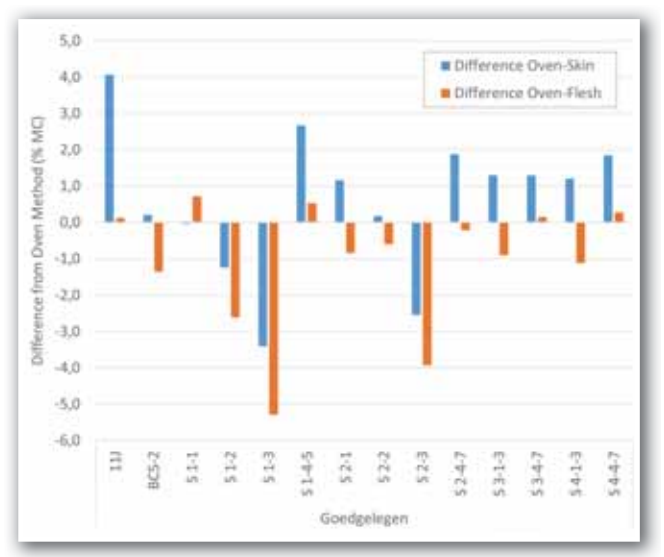
Figure 2. External validation of two handheld NIR methods (skin intact and skin removed/flesh) for 'Carmen®-Hass' from 14 orchards at Goedgelegen Estate in Mooketsi between week 4 and week 7 in 2014.

No results are available for the semi-commercial testing of 'Fuerte' at the Westfalia Pack House at the time of going to press.