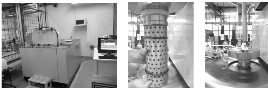
Figure 1. Avure small-scale experimental High Pressure Processing unit and sample chamber.

Avocado fruit from the three different avocado growers were treated on each of three separate days (i.e. three replications). Avocado were sliced and vacuum-packed using a commercial high oxygen barrier pouch (69 \mu\text{m} thick) with an oxygen transmission rate of less than 10 cc and held on ice until treated. Within 3 h, the slices were subjected to pressure of 200 to 600 MPa for durations of 3, 6 or 10 min (at ambient temperatures; Figure 1, a 2-L Avure HPP equipment). Slices were then transported on ice back to the laboratory and assessed within 3 hours for colour change ( L^* , C , h^\circ ), respiration rate ( \text{CO}_2 production), ethylene production, and tissue samples taken for measurement of polyphenol oxidase (PPO) activity and cell microstructure by Cryo-SEM. Control samples were sealed in bags and transported together with the HPP-treated product in an identical manner.