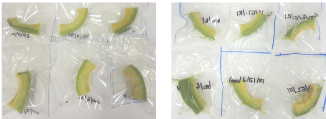
Figure 2. Avocado slices in high oxygen barrier pouch before (left) and after (right) high Pressure Processing (HPP) treatment at 600 MPa for 6 min.

High pressure processing resulted in subtle changes to the appearance of avocado slices (Figure 2). Based on the objective measurement using a Chromameter, increasing pressure (200 - 600 MPa) and exposure time decreased the lightness (L*) of the slices and the slices became slightly darker (57.47 - 52.45 for the outside (i.e. dark green layer) of slices, and 69.54 - 65.56 for the side of slices). Hue angle (h°) for the side of the slices increased slightly with HPP treatment up to 600 MPa (from 101.4 - 105.07). We also observed a similar trend for chroma (C) to that of hue angle, where the side and outer edge of the avocado slices also decreased marginally, from 32.64 - 30.68 and 28.05 - 26.27, respectively. However, the effect of exposure time with increasing pressure to HPP on colour changes was not conclusive.