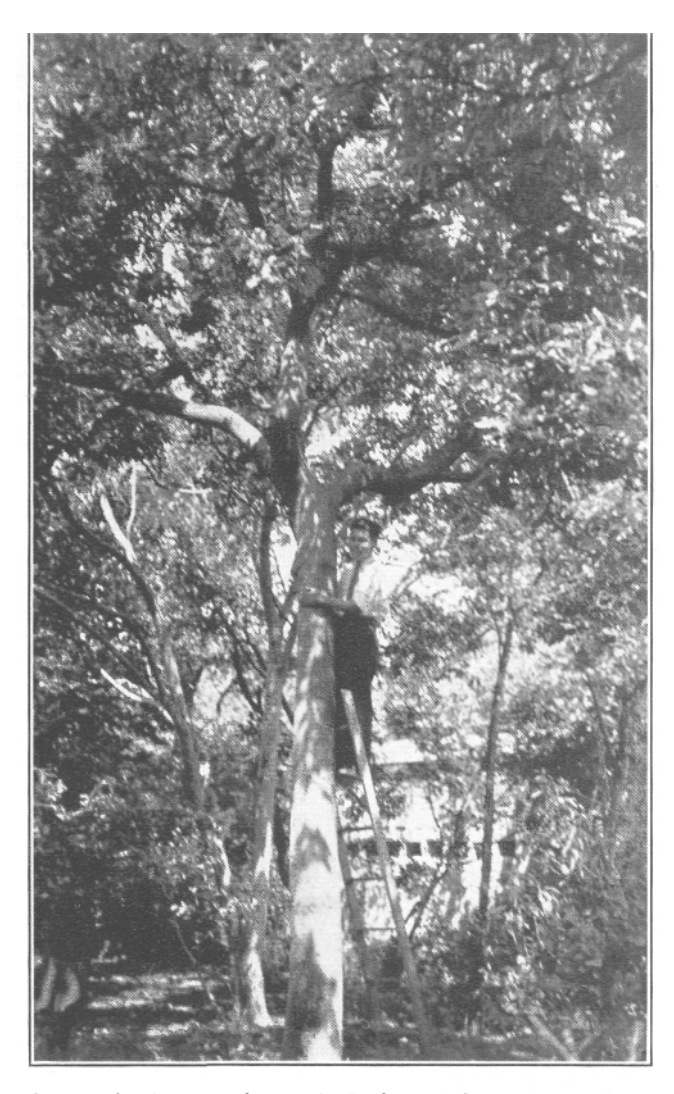
Summer bearing avocado tree in LeBlanc garden, 3 Poniente 24, Atlixco, Mexico. The fruits mature in June and July, are of the same shape, size and size of seed as the Fuerte fruits but have a dark colored skin. Senora LeBlanc said that they were equal to if not superior to Fuertes. Photographed Oct. 7, 1936.

The crushed leaves of the summer-bearing tree had a slight anise odor similar to that of the leaves of the parent Fuerte tree. Both trees are of seedling origin but from the resemblance of the budded progeny trees of the Fuerte variety in Southern California to that of the parent tree, it seems reasonable to assume that the budded progeny of the summer bearing tree will develop and perform in Southern California in a similar manner to that of the parent tree. Senora LeBlanc graciously gave us 25 budsticks from the summer bearing tree for our use in Southern California, and the buds have been propagated successfully since our return. It is hoped that this introduction will prove to be of commercial value to our industry.