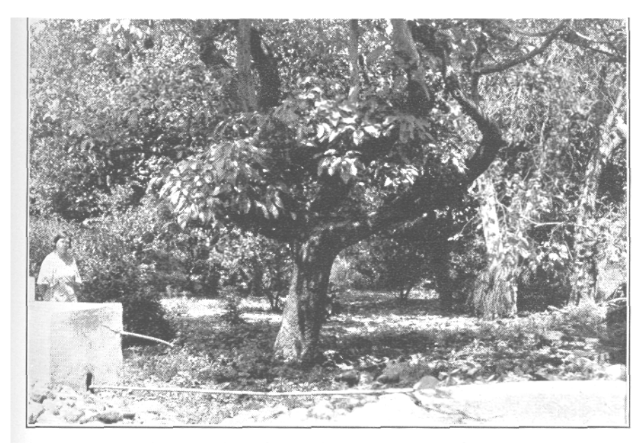
Parent Fuerte avocado tree in the LeBlanc garden, 3 Poniente 24, Atlixco, Mexico, with Senora LeBlanc at left. Note the peculiar twisted growth of the main limbs that is characteristic of the progeny trees in Southern California.

This road is bordered by ornamental plantings including those of willow, populus, eucalyptus, and Mexican Cedar ( Cedrela Mexicana M. Roemer) trees. As we approach the mountain pass, the elevation of which is about 12,000 feet above sea level, we found that the mountain sides are clothed with deciduous-leaved oaks, and further up, with short and long-leaved pine trees. Near the entrance to the pass, on a clear day, one catches glimpses of the magnificent peaks, snow-capped Popocateptl (17,876 ft.), or "smoking mountain", and snow-crowned Ixtacihuatl (17,343 ft.), or "Sleeping woman". A valley in which the beautiful Rio Frio flows through a glorious mountain meadow with an ancient village nestled at the bridge, is a welcome interlude on the trip to Atlixco. Then, dipping down the mountain side, on the eastern slope, into the Puebla valley, Mt. Orizaba (18,701 ft.) rises majestically in the distance, one of the grandest mountains in all the world, its peak clad with perpetual snow and ice.