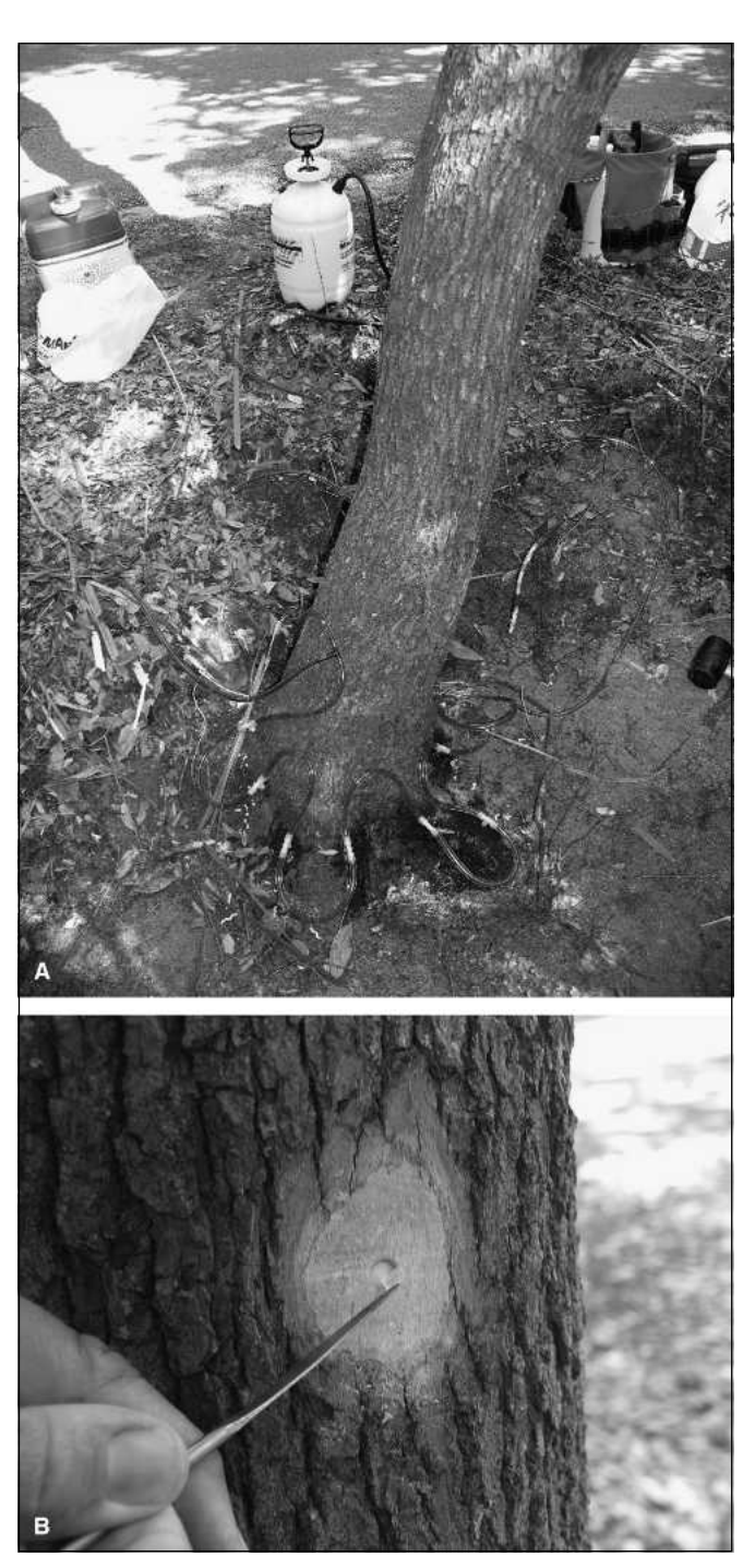
Figure 1. Macroinfusion of redbay tree with the fungicide propiconazole (A). Inoculation of redbay trees by placing an agar plug with the laurel wilt pathogen ( Raffaelea spp.) into a hole in the outer xylem (B).

On 19 April 2007 (2 to 3 weeks after fungicide injection), all 20 trees (fungicide-treated and control trees) were inoculated with Raffaelea spp. Two isolates of the fungus were used, one from Ft. George Island, Florida (FG) and one from Hilton Head Island, South Carolina (HH5) (isolates provided by S.W. Frae-