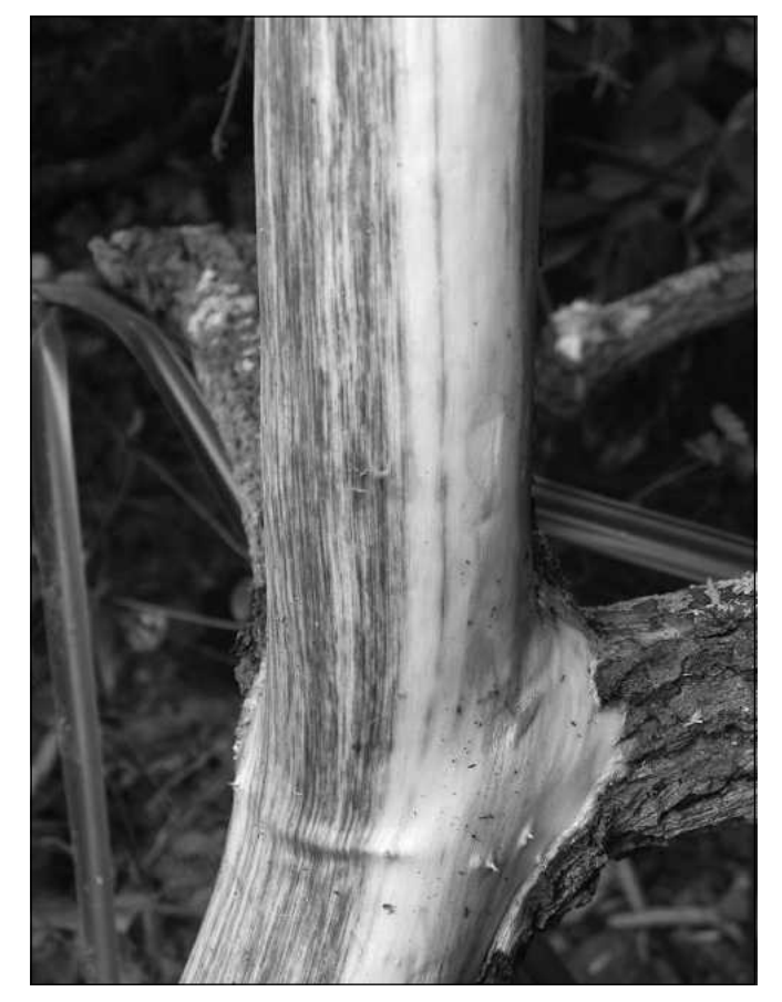
Figure 3. Black discoloration in the outer sapwood of a redbay tree 6 weeks after artificial inoculation with the laurel wilt pathogen, Raffaelea spp.

<sup>y</sup>Among trees inoculated with Raffaelea spp., the proportion of trees from which Raffaelea spp. was reisolated significantly differed between the propiconazole group and the untreated group ( \chi^2 = 13.33 , P = 0.0003).